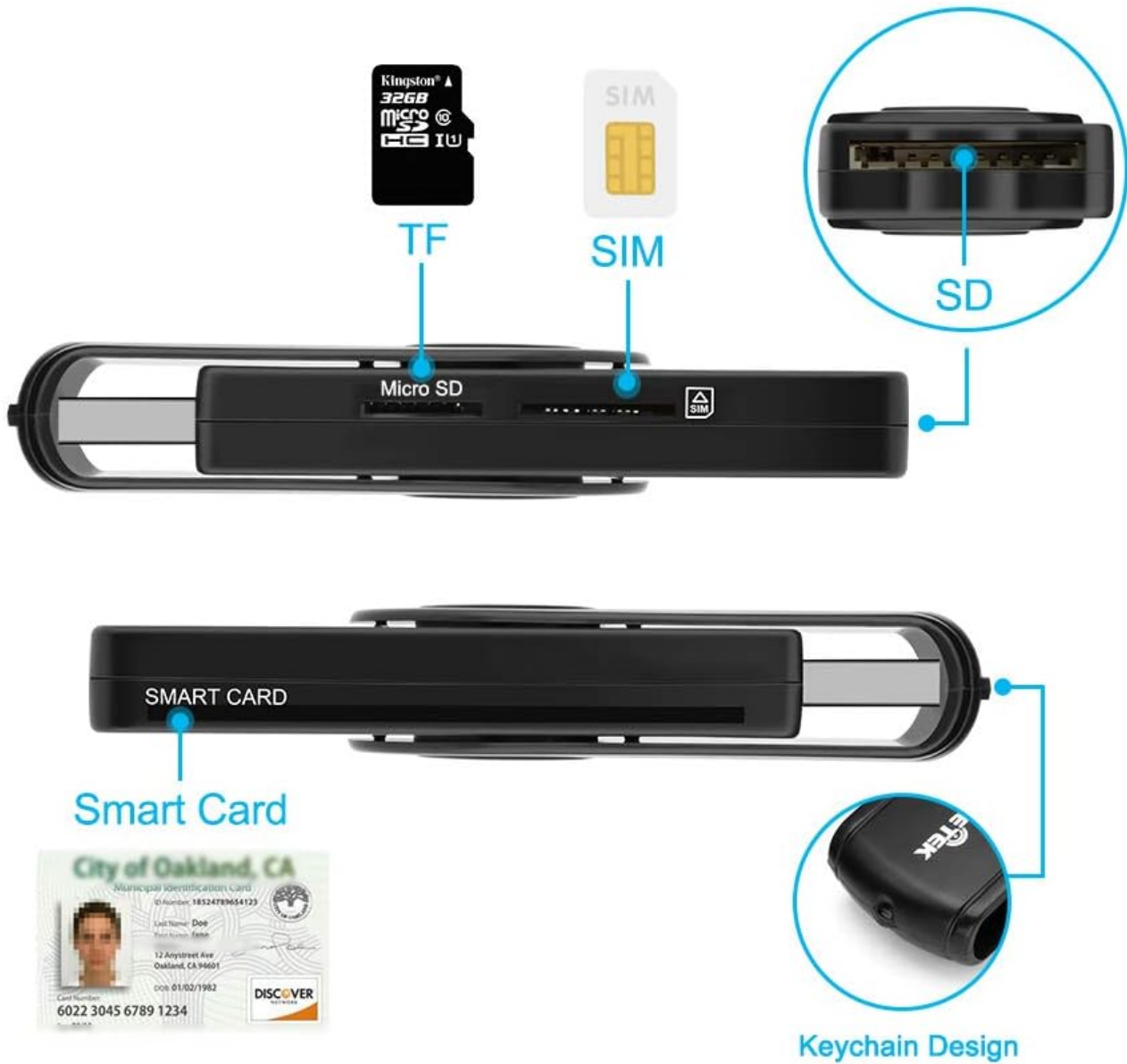
Image 2: A diagram illustrating the various card slots on the Rocketek RT-SCR10, including Micro SD, SIM Card, SD Card, and Smart Card slots.