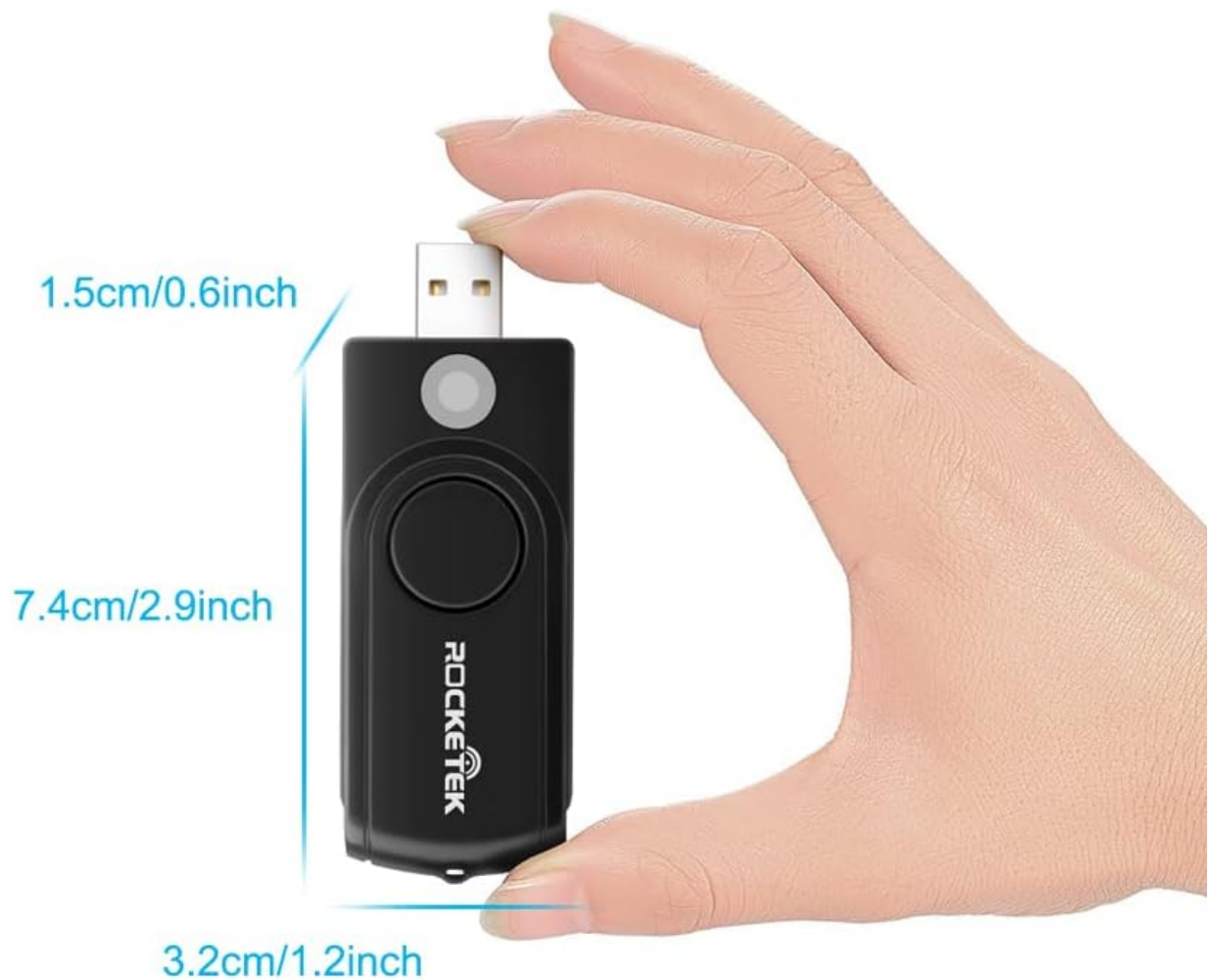
Image 8: The compact design of the Rocketek RT-SCR10, with its dimensions clearly indicated for portability.