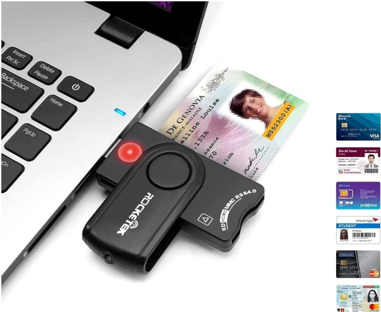
Image 6: The Rocketek RT-SCR10 USB Smart Card Reader connected to a laptop, with an SD card inserted into its dedicated slot, ready for data transfer.

Compatible: Government ID,National ID,AKO,OWA,DKO,JKO,DCO,CAC Cards etc