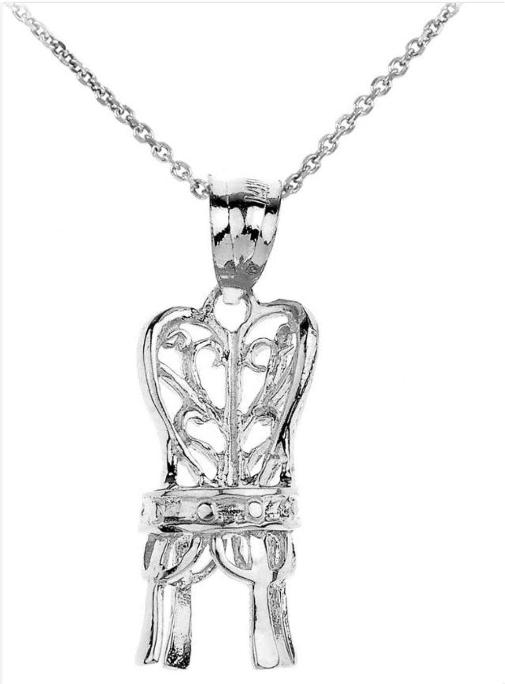
Figure 1: Front view of the 925 Sterling Silver Elegant Chair Pendant Necklace, showcasing the pendant and chain.