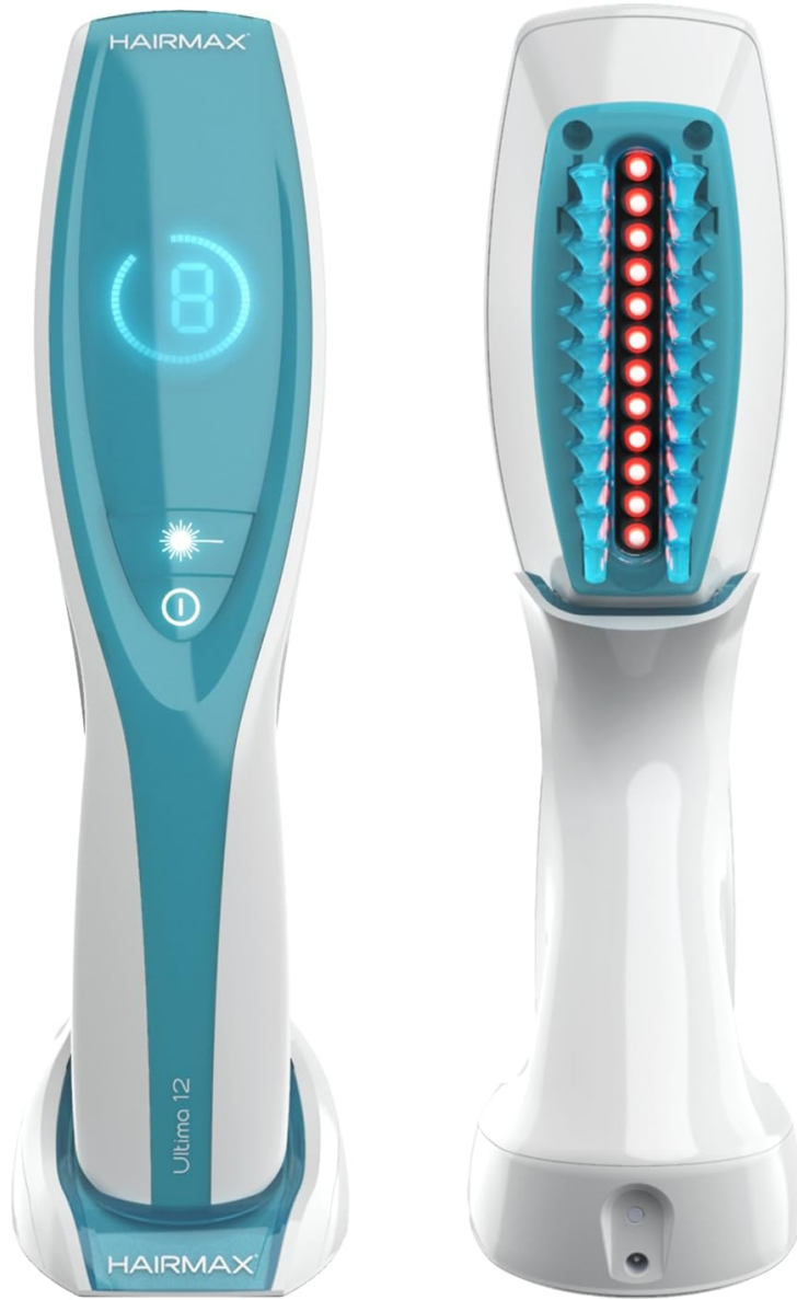
This image displays the Hairmax Ultima 12 LaserComb, showing both the front view with its display and the underside with the laser diodes, alongside its charging cradle.