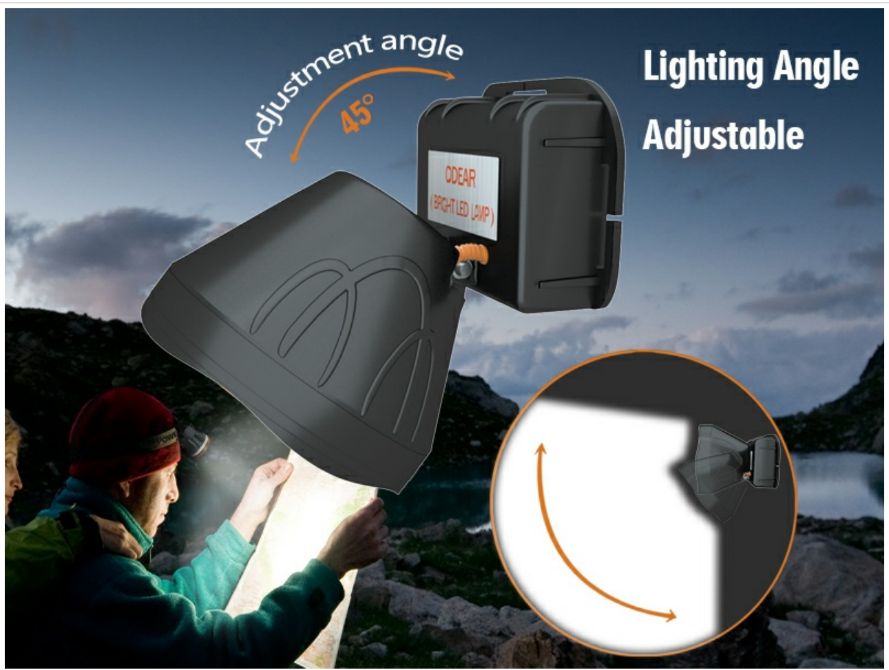
Image: Illustration demonstrating the 45-degree adjustable lighting angle of the headlamp for directing light as needed.