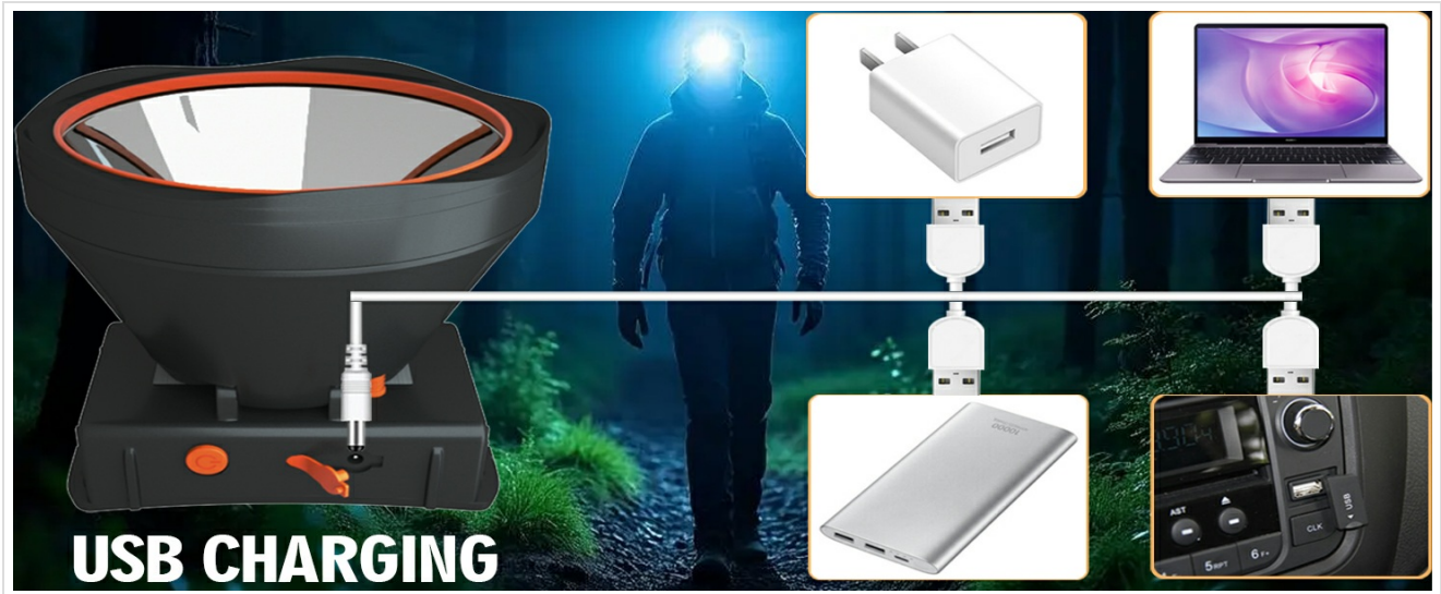
Image: Diagram illustrating various methods for USB charging the headlamp, including wall adapters, power banks, and laptops.