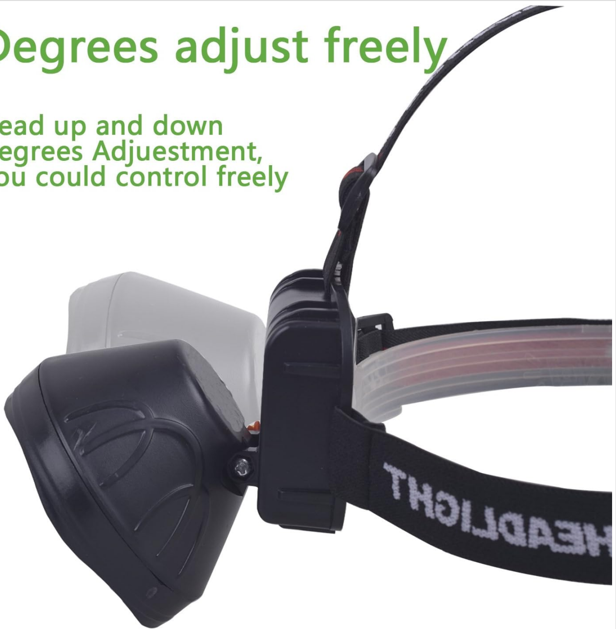
Image: Diagram showing the headlamp's adjustable lamp holder, allowing for flexible lighting angles up to 45 degrees.

Head up and down Degrees Adjustment, You could control freely