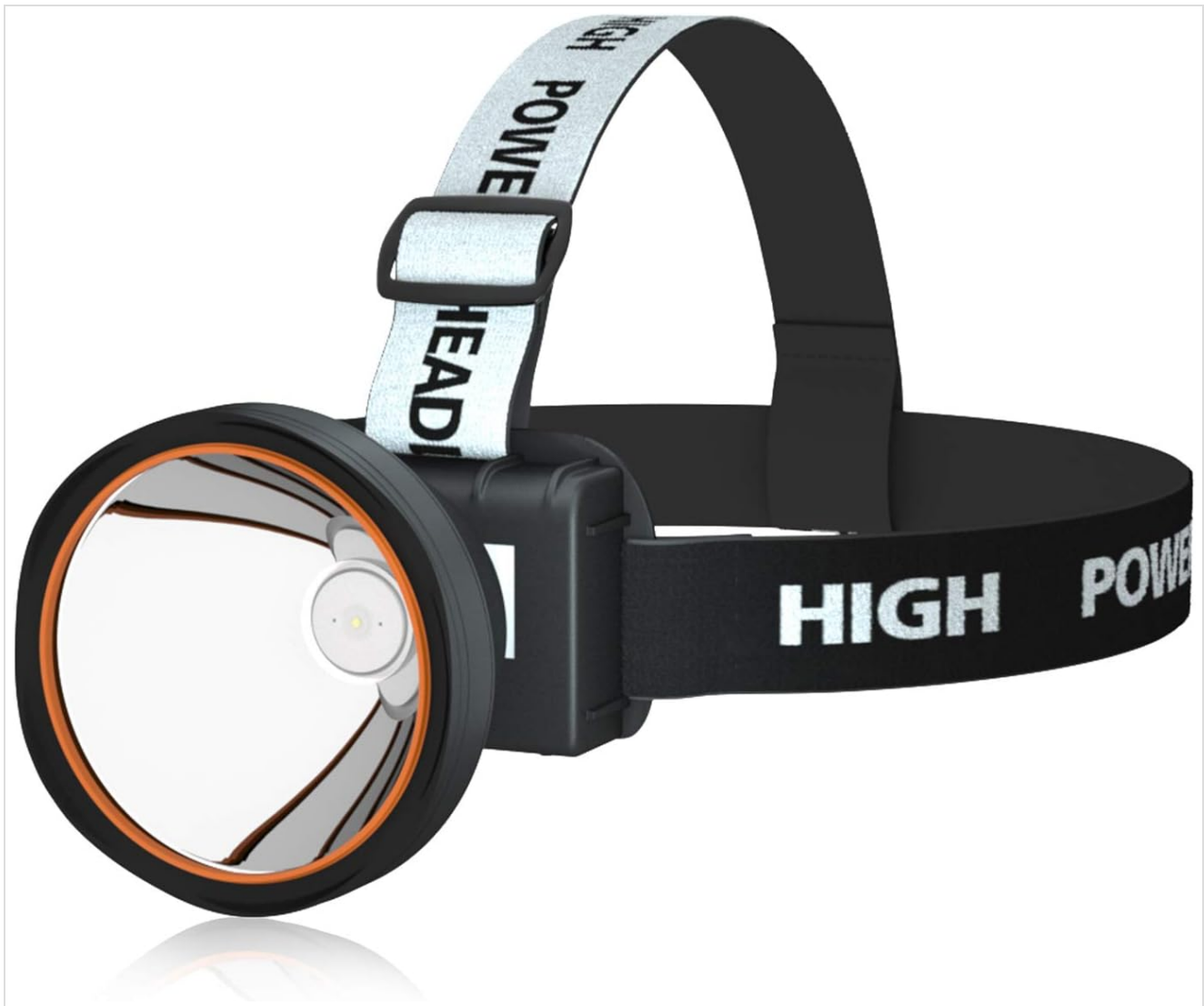
Image: The ODEAR L11 Rechargeable LED Headlamp with its adjustable strap, showcasing its compact design.