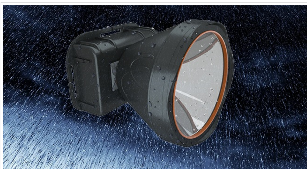
Image: The headlamp shown with water droplets, indicating its IPX5 water-resistant design, suitable for use in light rain.

The ODEAR L11 headlamp is rated IPX5, meaning it is protected against splashing or spraying water from any angle. It is suitable for use in rainy conditions but should not be submerged in water.