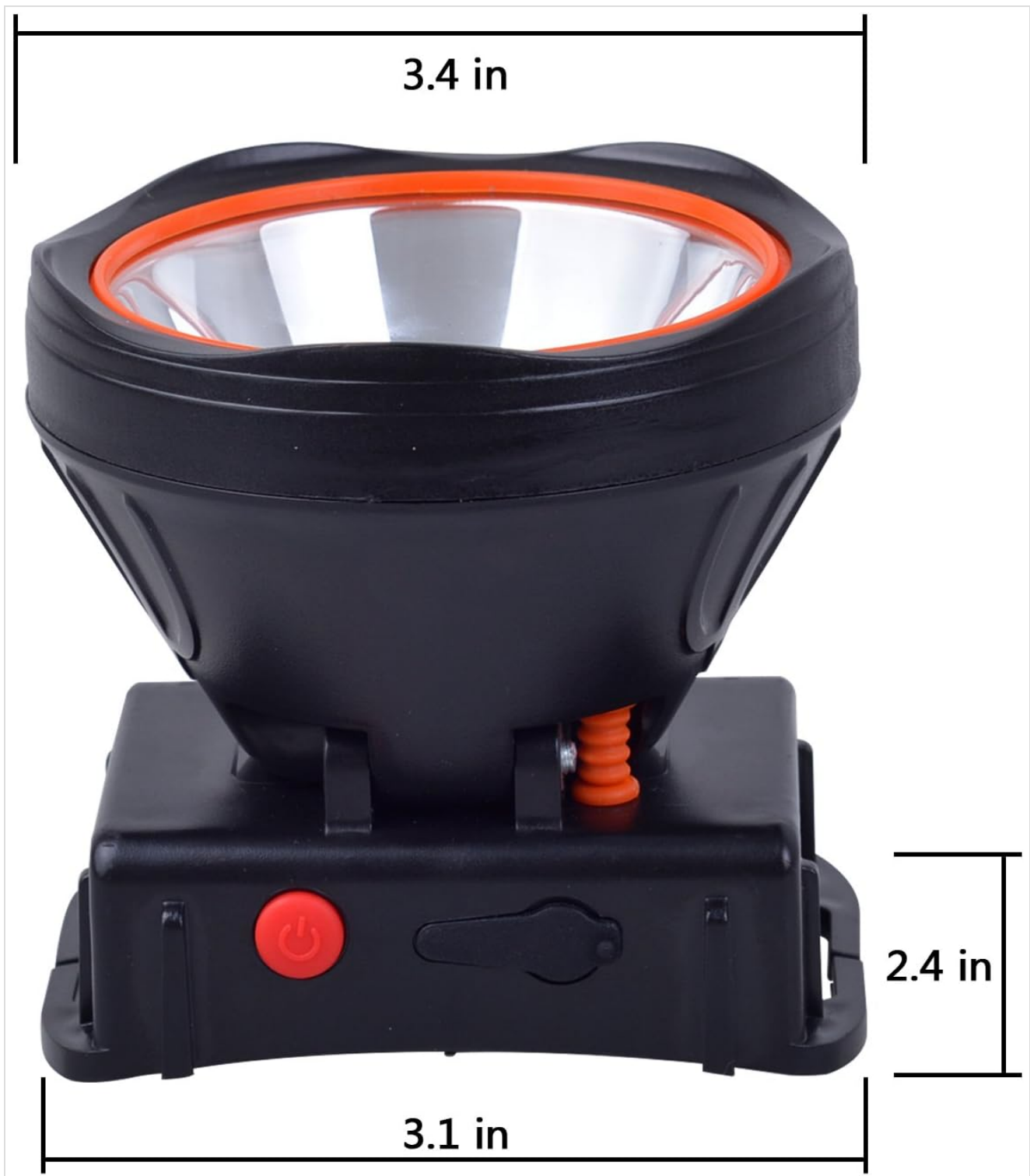
Image: Technical drawing illustrating the dimensions of the ODEAR L11 headlamp, showing its compact size.