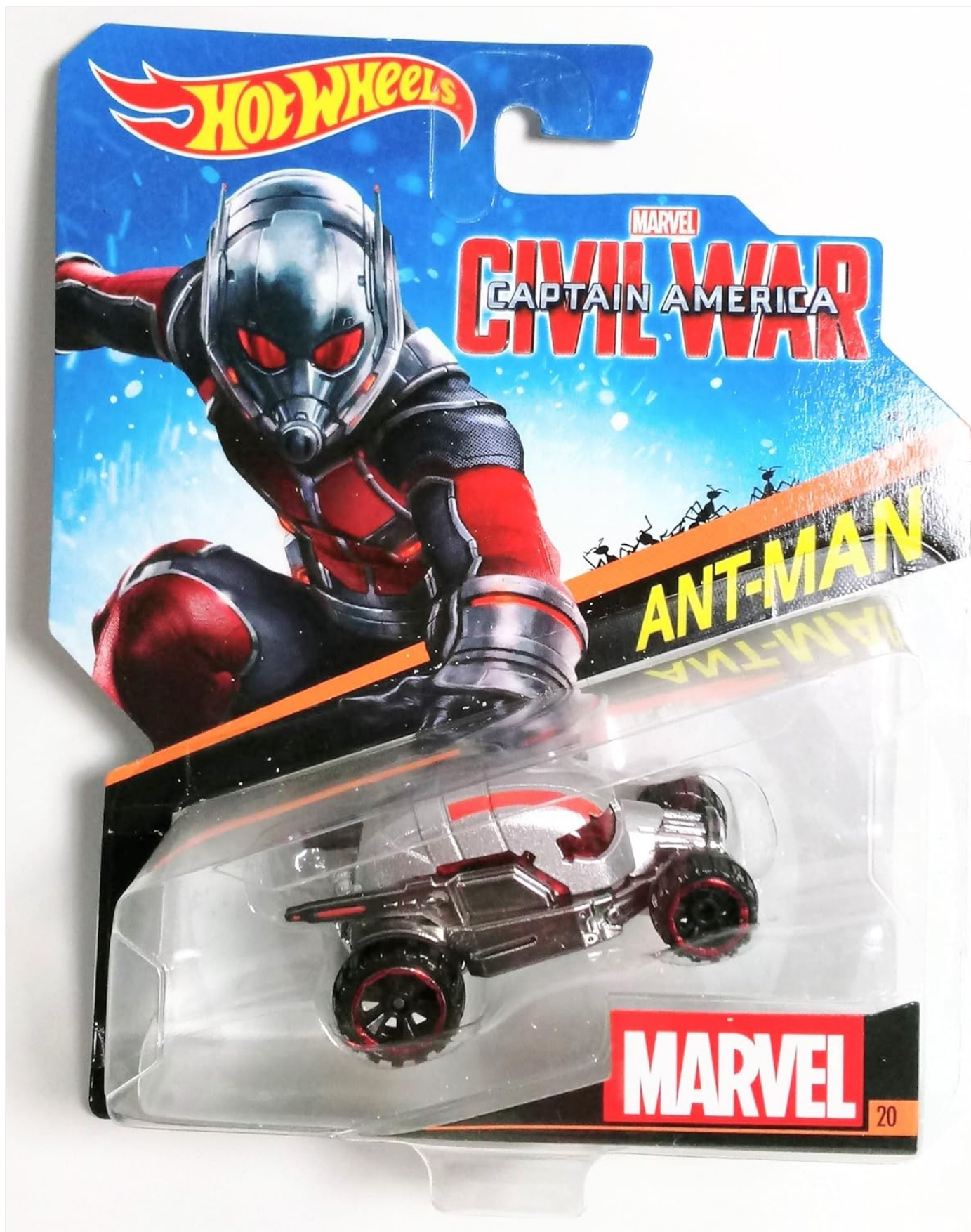
Image: Front view of the Hot Wheels Marvel Ant-Man Character Car #20 in its blister packaging, showing the car and Ant-Man artwork.