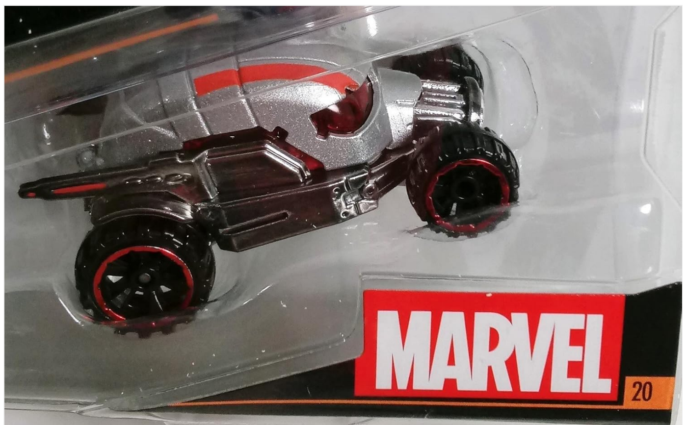
Image: Detailed view of the Ant-Man Character Car, highlighting its silver and red design and rugged wheels.