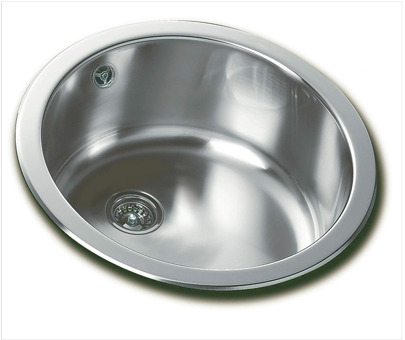
Image 1: Teka Eline Round Stainless Steel Sink, showing the polished finish and single bowl design.