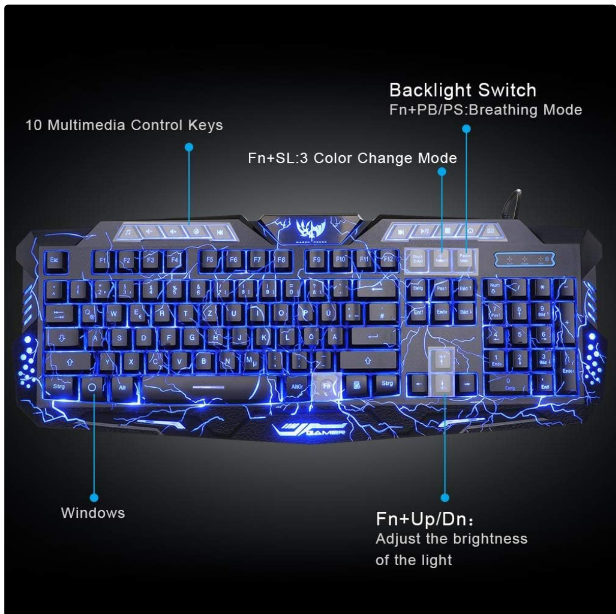
Image 4.2: Detailed view of the keyboard's backlight switch and multimedia control keys.