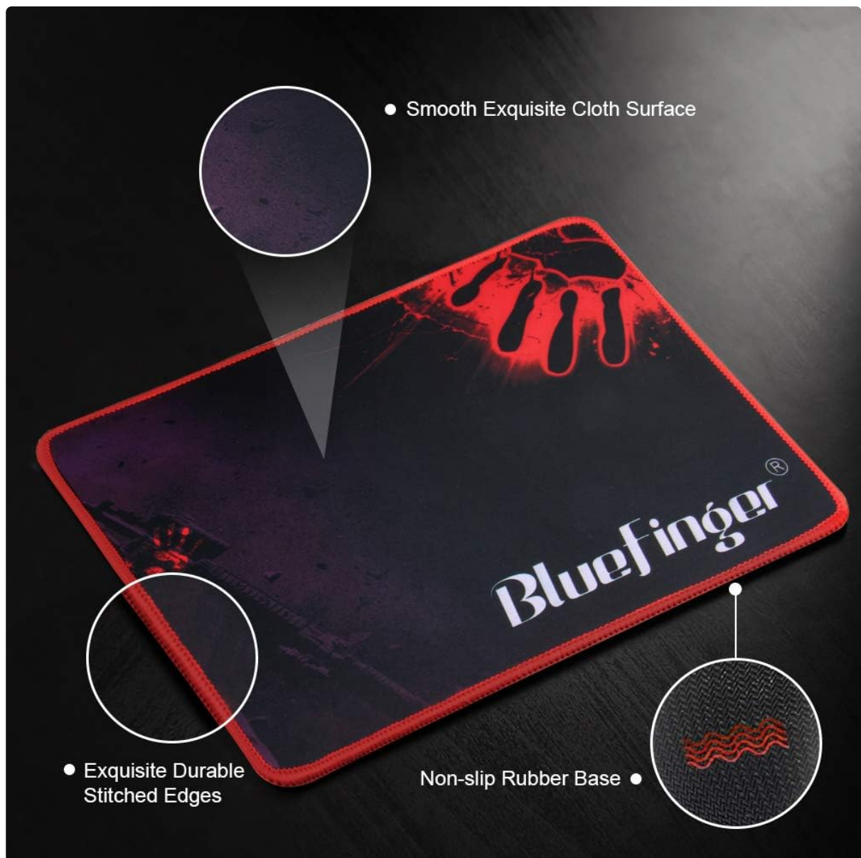
Image 4.4: Close-up view of the mouse pad highlighting its smooth cloth surface, durable stitched edges, and non-slip rubber base.