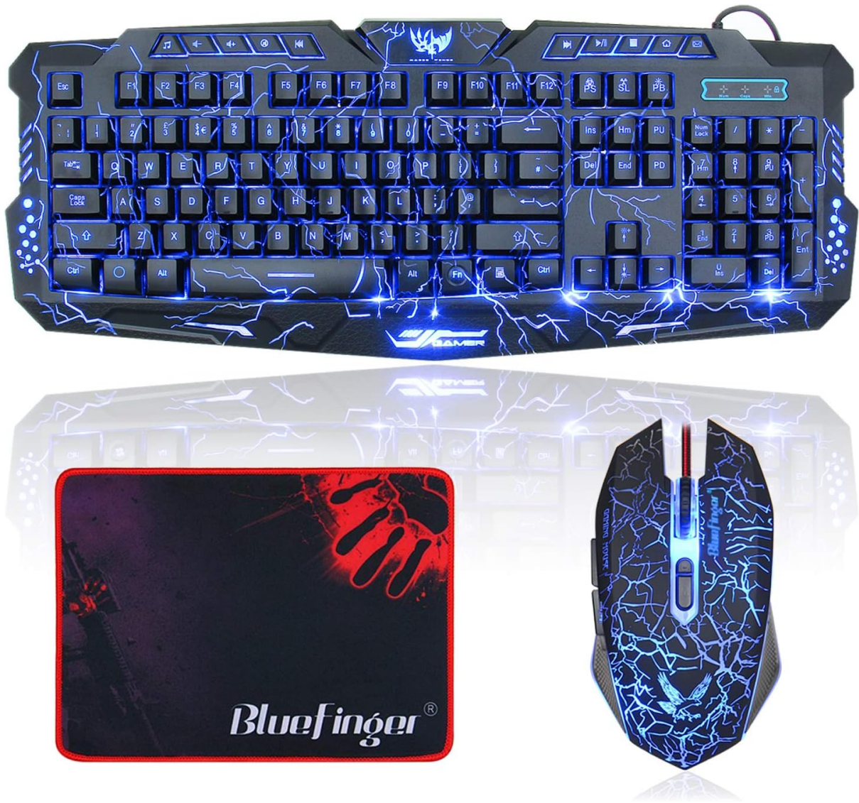
Image 1.1: Overview of the BlueFinger Gaming Keyboard and Mouse Combo, including the keyboard, mouse, and mouse pad.