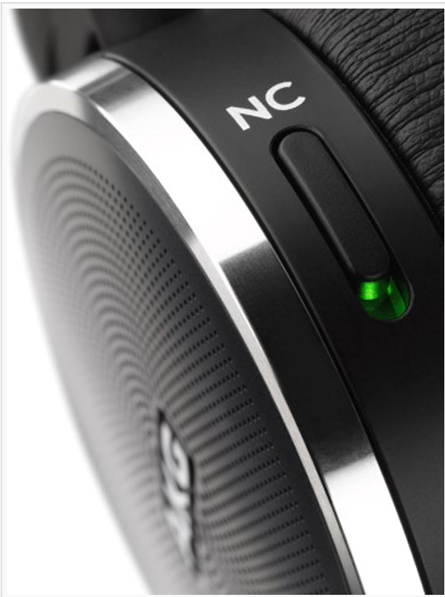
A detailed view of the active noise-cancelling (NC) switch located on the earcup, indicated by a green light when active.