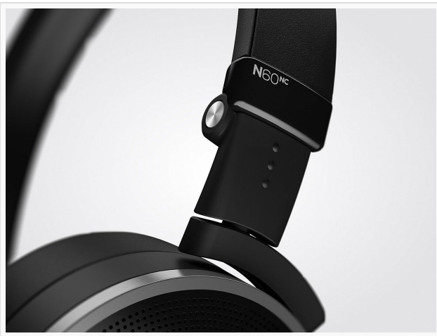
Detail of the headband adjustment mechanism, allowing for a customized and comfortable fit.