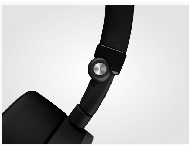
The robust folding hinge, enabling the headphones to collapse for easy storage and portability.