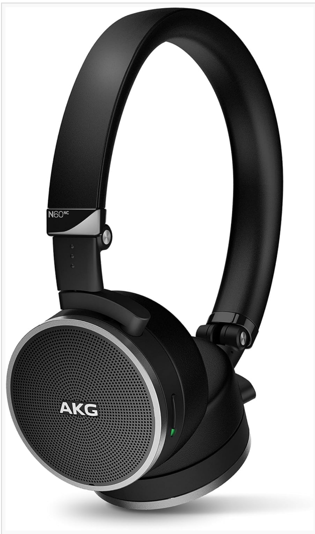
The AKG N60 headphones in black, showcasing their sleek design and on-ear form factor.