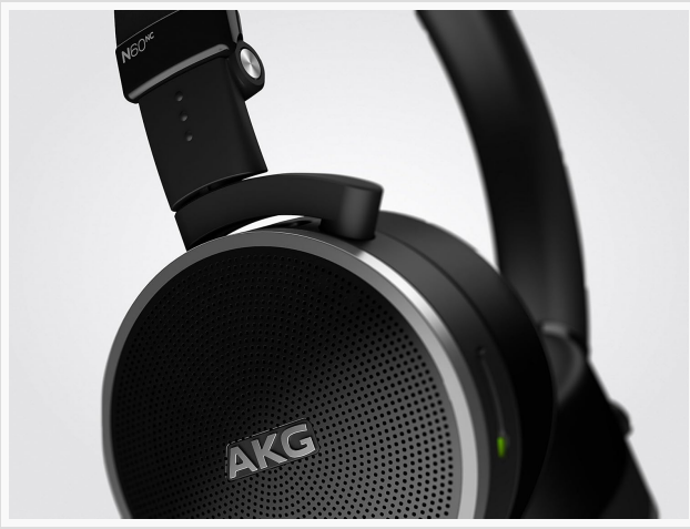
A close-up of the earcup, featuring the AKG logo and the perforated design for acoustic performance.