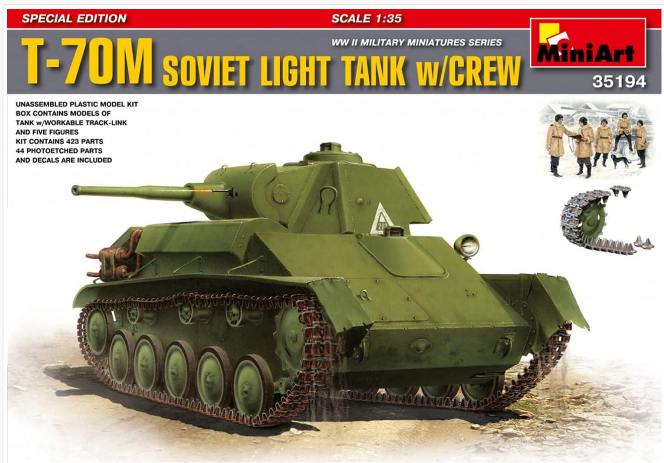
Image: The front of the MiniArt T-70M Soviet Light Tank with Crew model kit box. It features an illustration of the tank and crew, along with text indicating it's a 1:35 scale unassembled plastic model kit with workable track links, five figures, 423 parts, photo-etched parts, and decals.