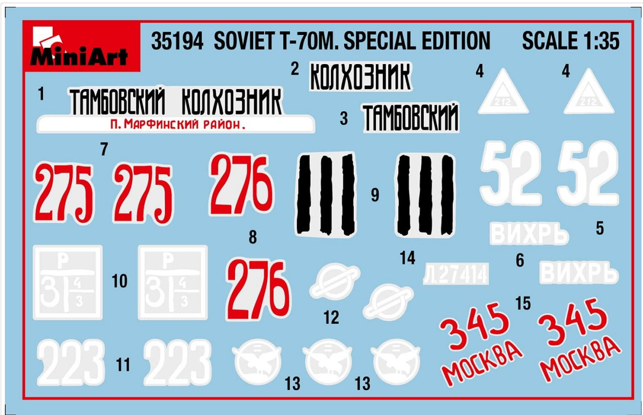
Image: A decal sheet for the MiniArt T-70M model kit, featuring various numbers, slogans in Cyrillic, and unit markings in red, white, and black, for customizing the tank's appearance.