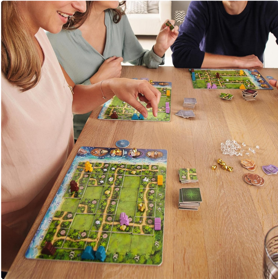
Image: Multiple player boards during game setup, showing adventurers and temples in place.