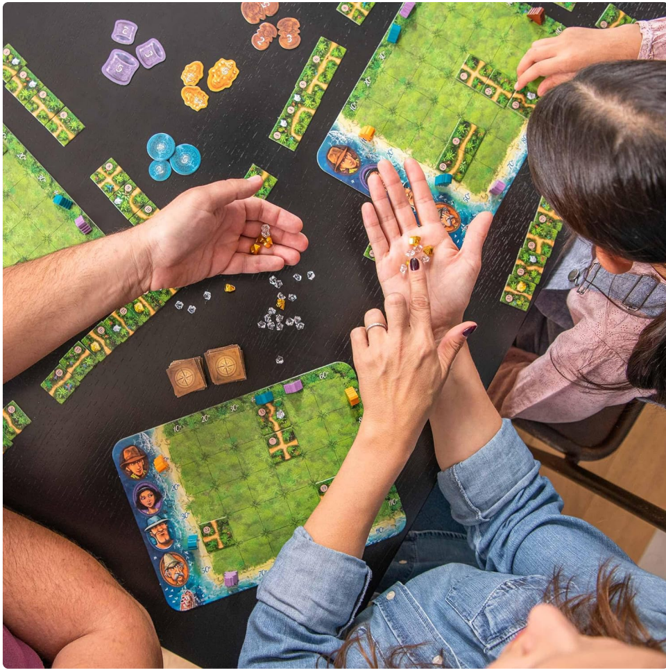
Image: Players engaging in gameplay, laying down path tiles and collecting gold nuggets and crystals.