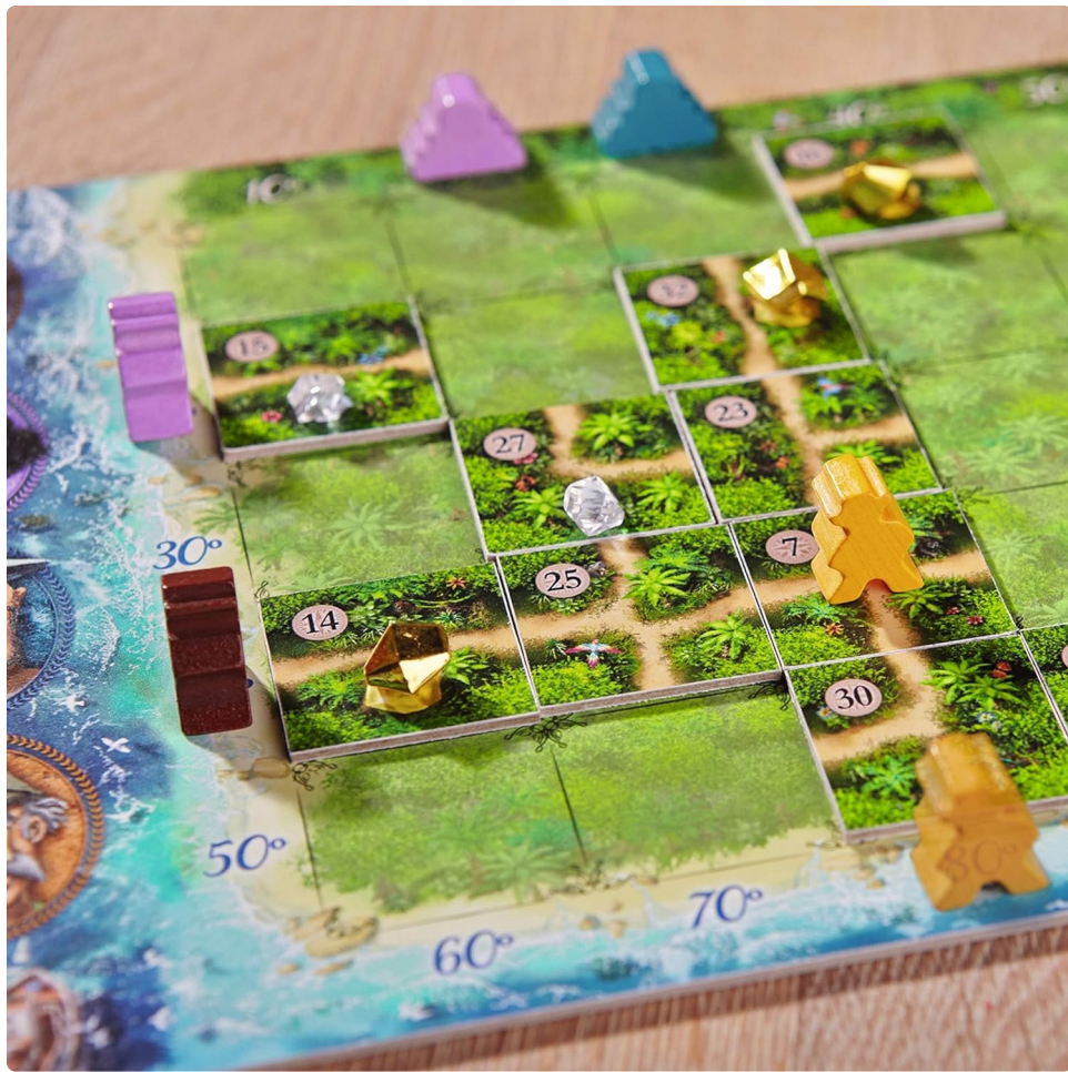
Image: A close-up of the game board, illustrating adventurers moving along paths and collecting treasures.