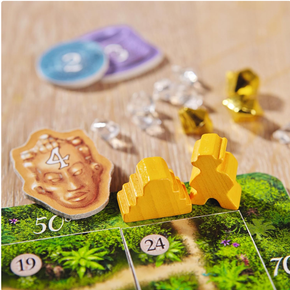
Image: A close-up view of various game components, including wooden adventurer pawns, temple pieces, and shiny treasure tokens.