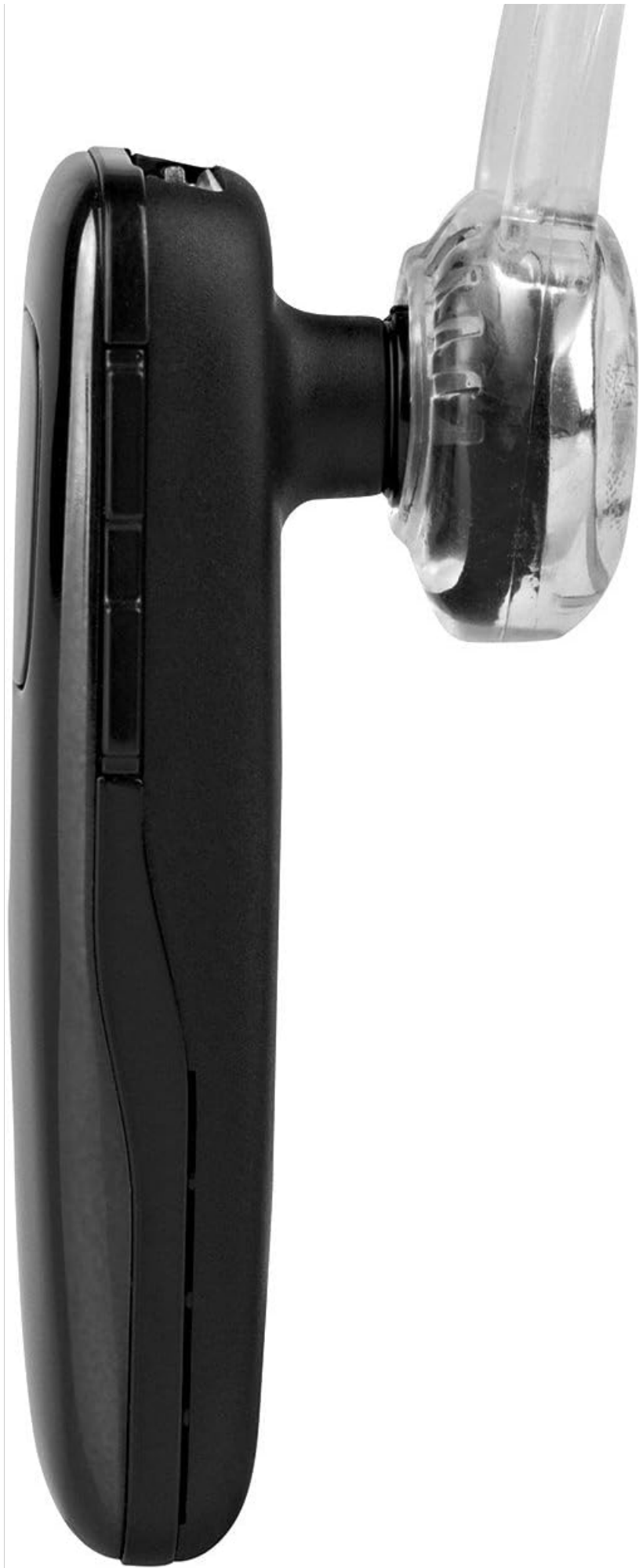
Figure 2: Plantronics M90 Headset Side View. This image shows the side profile of the headset, including the location of the charging port and volume controls.