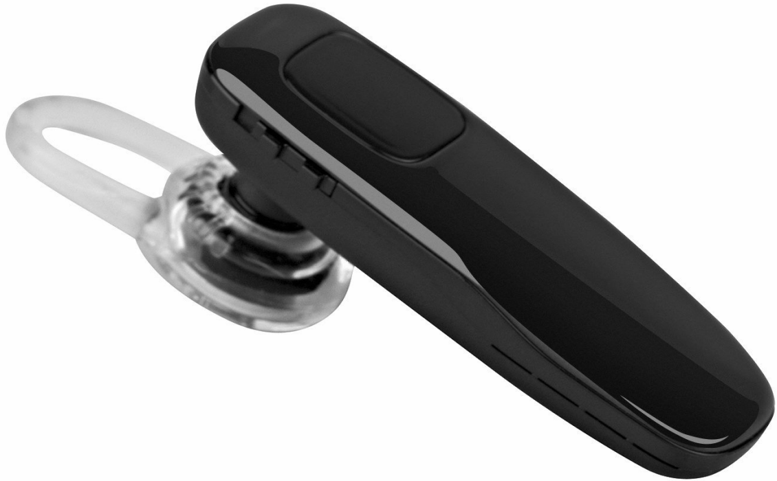
Figure 1: Plantronics M90 Headset Front View. This image displays the front of the M90 headset, highlighting its compact and ergonomic design.