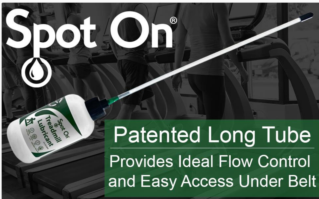
Image 5.1: The patented long tube applicator allows for easy and precise lubrication under the treadmill belt.