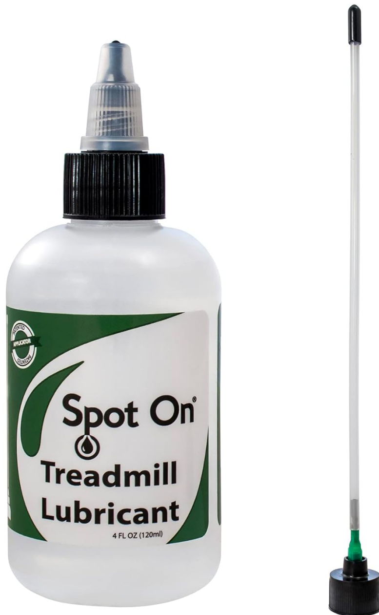
Image 3.1: Spot On 4 oz Silicone Treadmill Belt Lubricant bottle and applicator tube.