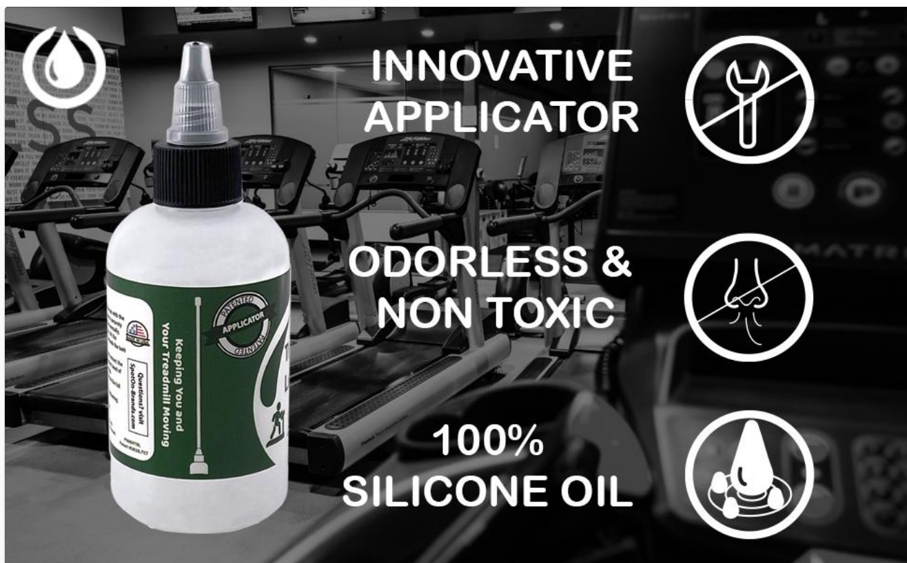
Image 3.2: Overview of product features including the innovative applicator, non-toxic and odorless nature, and 100% silicone oil composition.