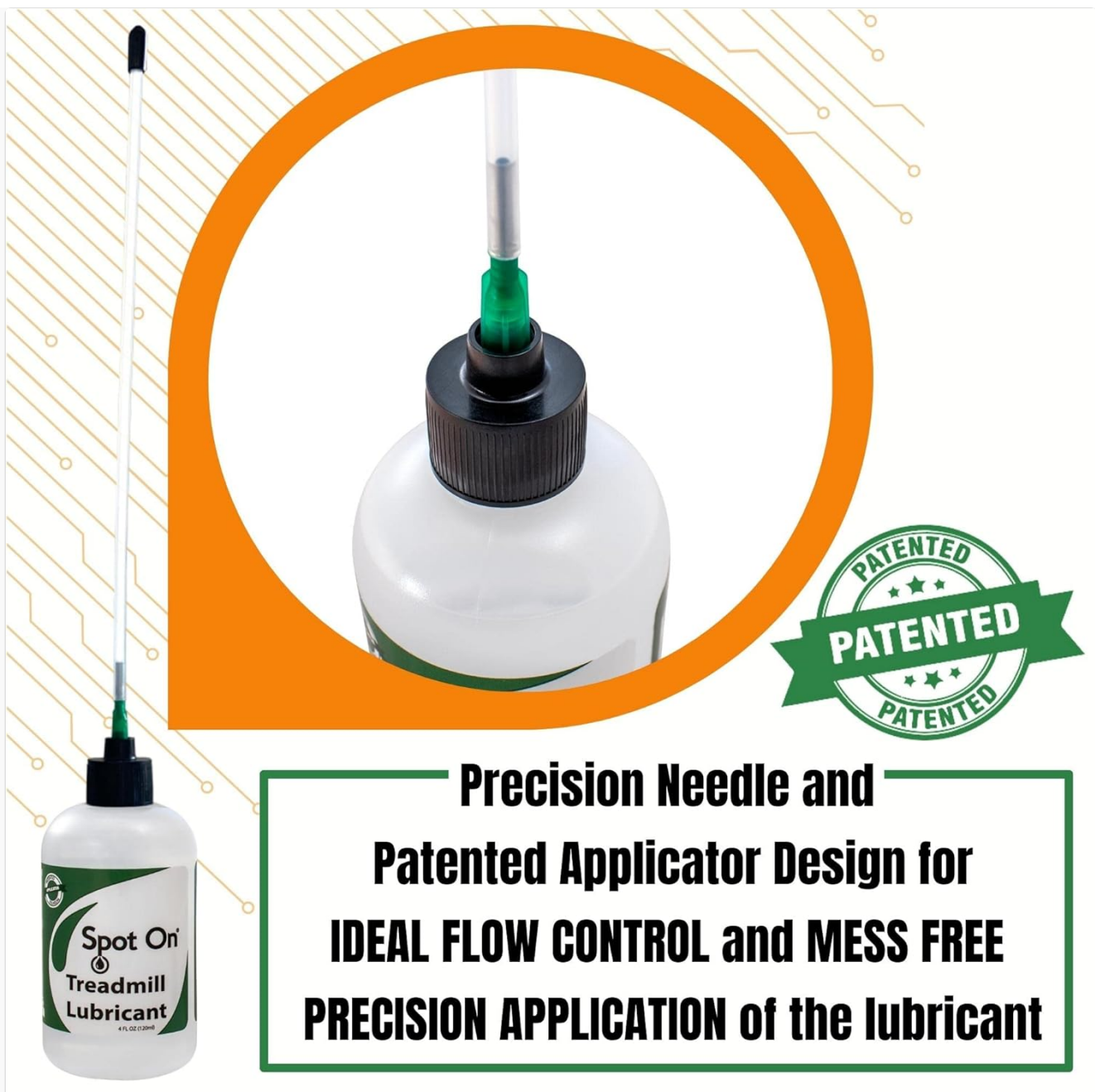
Image 4.1: The precision needle and patented applicator design for controlled lubricant flow.