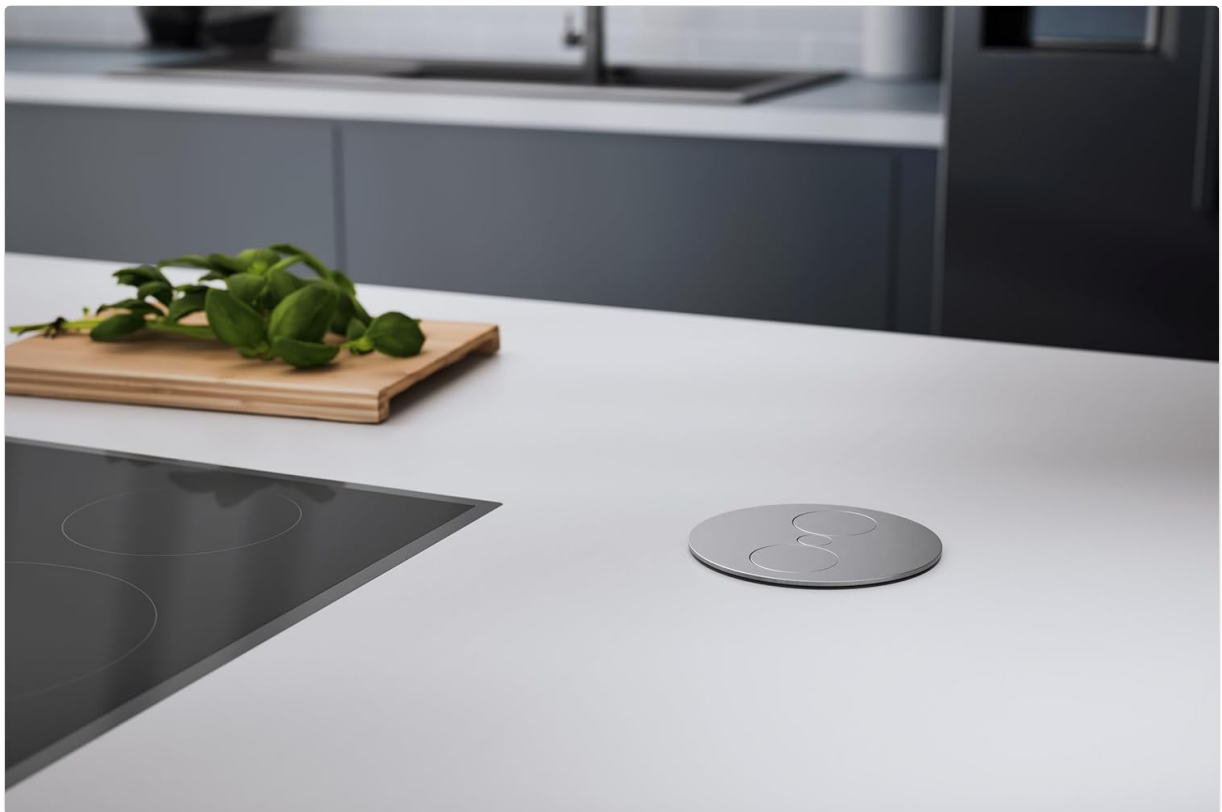
Image: The Bachmann Twist 931.021 unit seamlessly integrated and closed within a modern kitchen countertop, demonstrating its flush-mount design.