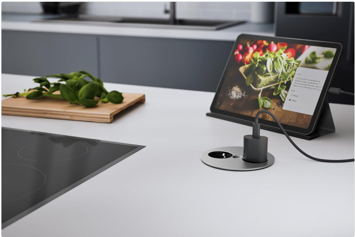
Image: The Bachmann Twist 931.021 unit integrated into a kitchen countertop, shown in its open position, revealing the two power sockets ready for use.