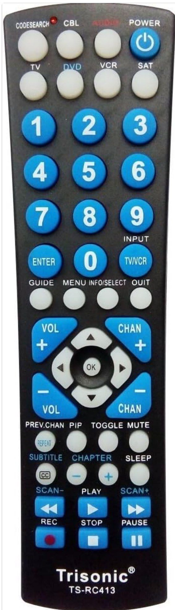
Figure 2: Universal Remote Control (Example Model: Trisonic TS-RC413)