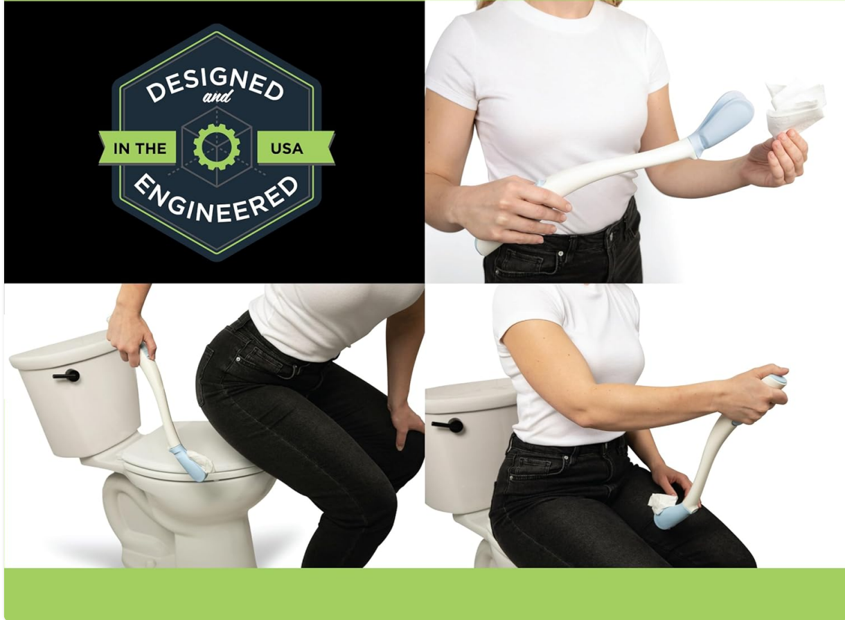
Image 4.1: Demonstrations of the Juvo Toilet Aid in various usage scenarios.