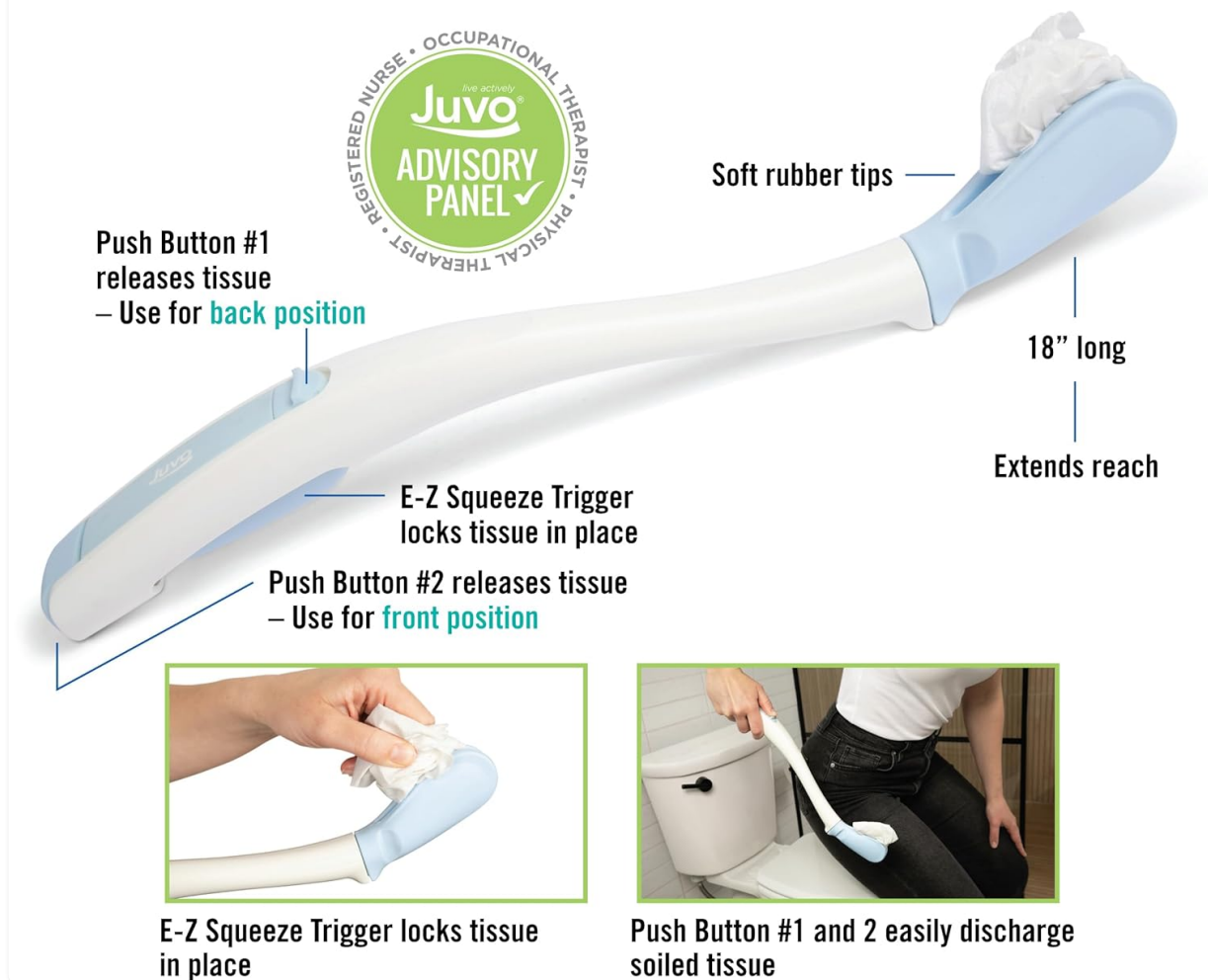
Image 2.1: Key features of the Juvo Toilet Aid, including its length, grip, and release mechanisms.