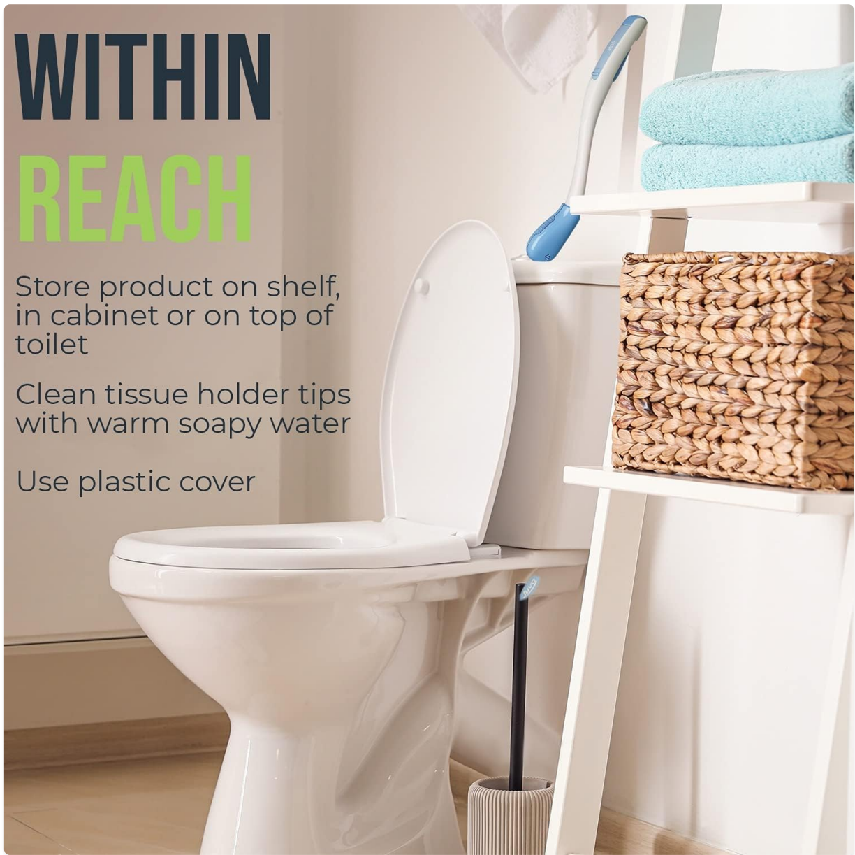
Image 5.1: Proper storage of the Juvo Toilet Aid with its protective cover.