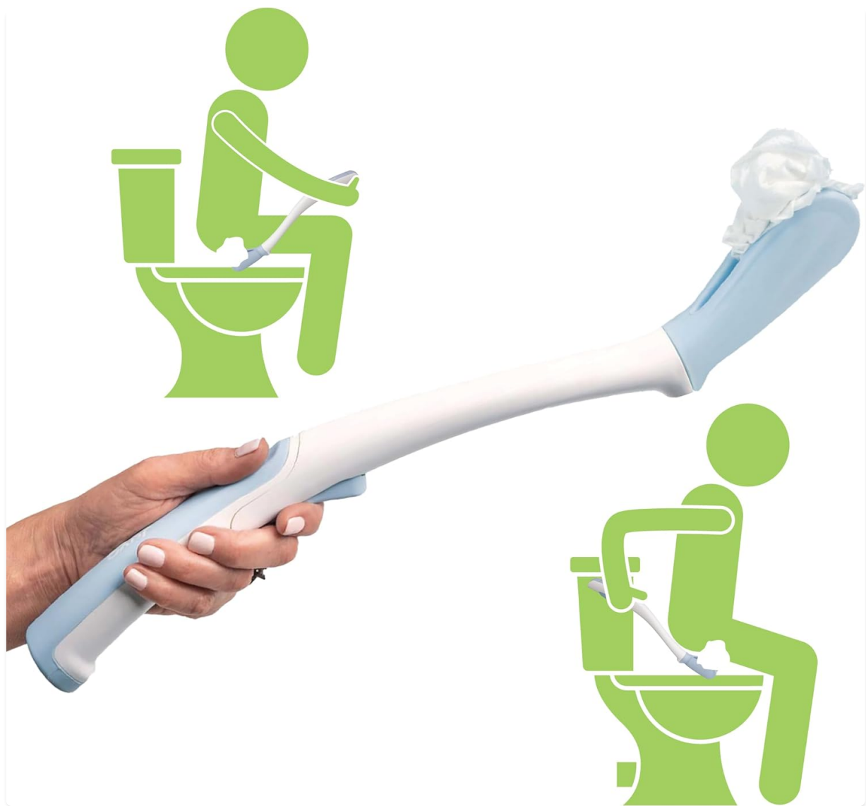
Image 1.1: The Juvo Toilet Aid, illustrating its use for both front and back wiping positions.

It is particularly beneficial for seniors, pregnant individuals, those with obesity, or individuals recovering from surgery who may experience difficulty bending, reaching, or twisting.