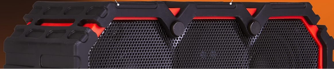
Image: The speaker shown with an overlay emphasizing its versatile Bluetooth connectivity for various devices.

Designed to provide just the right fit for any indoor or outdoor activity you have in mind. It's suitable for parties, pool side, beach, camping, road trips, traveling, and any other occasion.