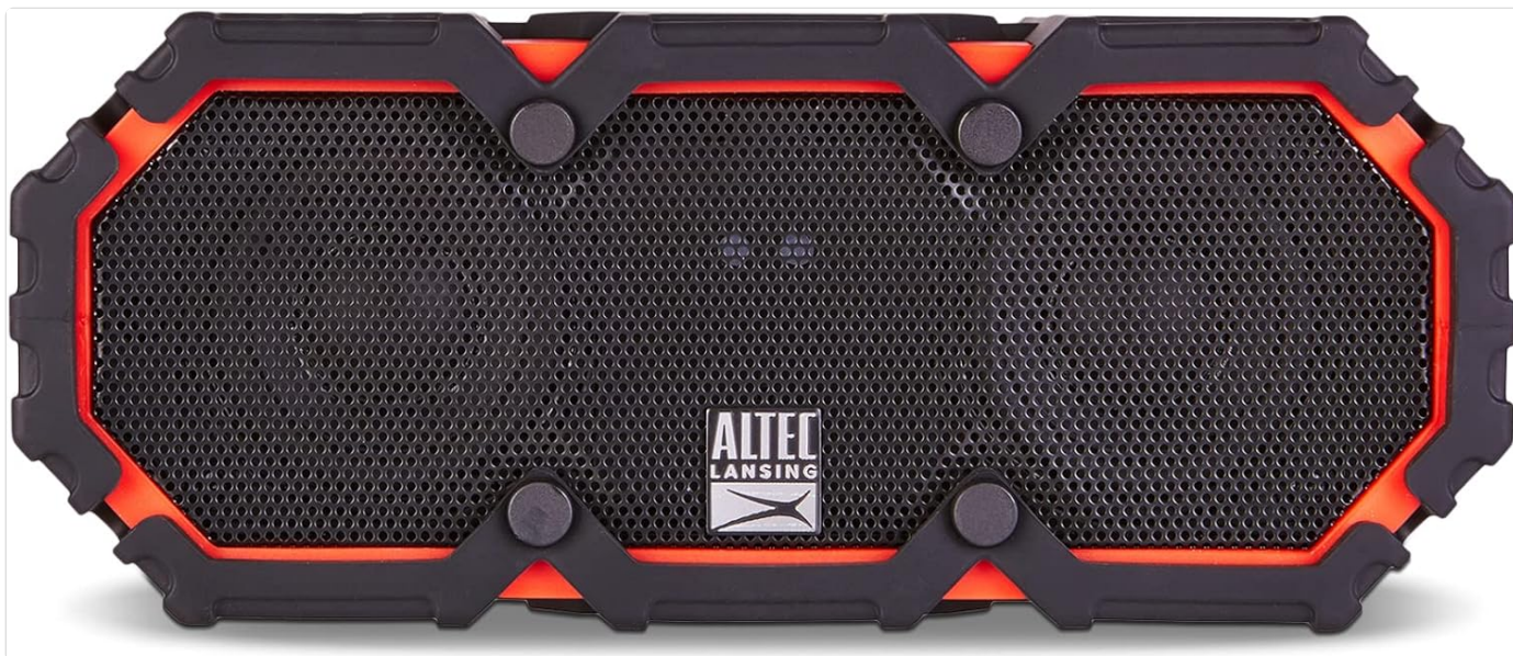
Image: Front view of the Altec Lansing LifeJacket 2 speaker, showcasing its deep red and black design with a mesh grille.

The Altec Lansing LifeJacket 2 is a rugged, waterproof Bluetooth speaker designed for portable audio enjoyment in various environments. This manual provides essential information for setting up, operating, maintaining, and troubleshooting your speaker to ensure optimal performance and longevity.