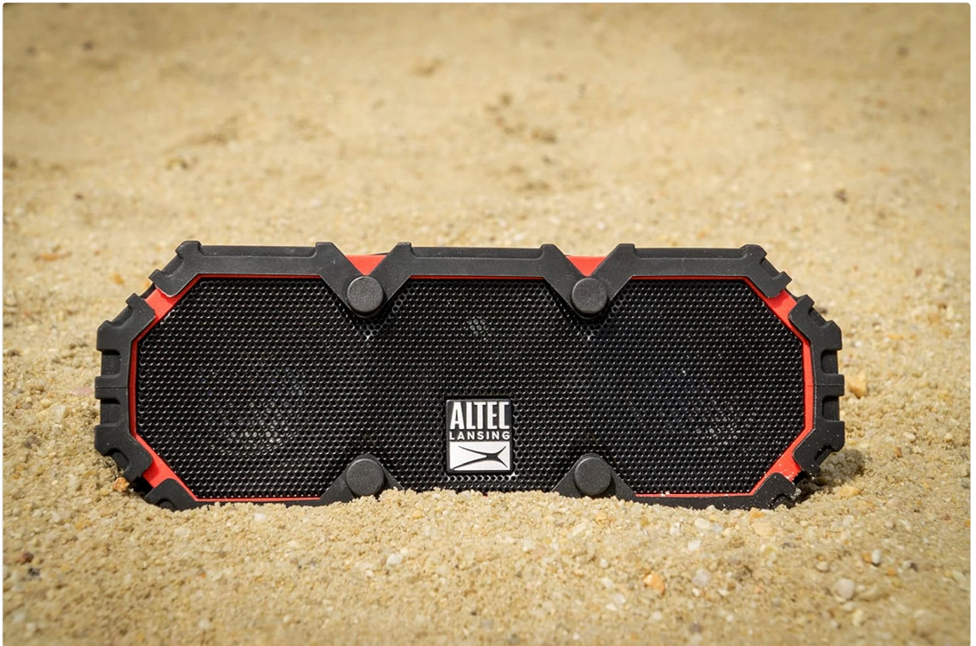
Image: The Altec Lansing LifeJacket 2 speaker positioned on sand, demonstrating its robust design for outdoor and beach environments.