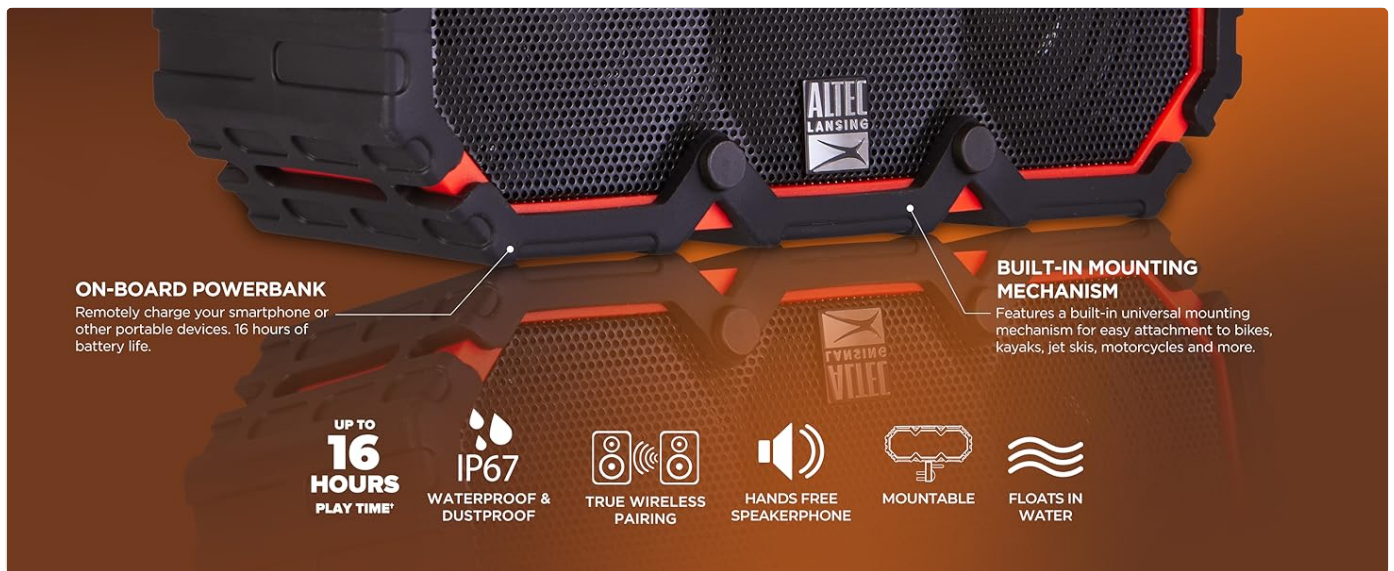
Image: A detailed view of the speaker, illustrating the location of the on-board power bank and the integrated mounting mechanism.