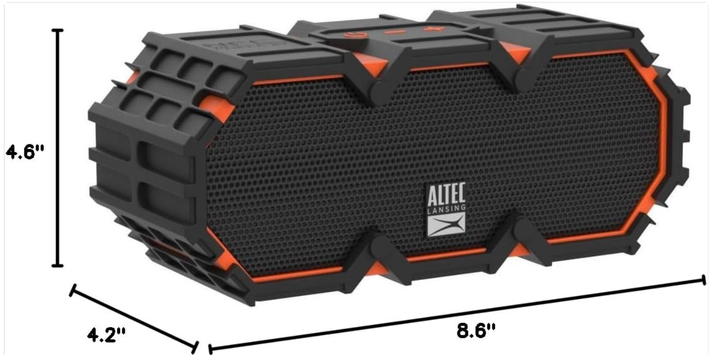
Image: The Altec Lansing LifeJacket 2 speaker with its approximate dimensions (8.6" L x 4.2" W x 4.6" H) clearly indicated.

Familiarize yourself with the speaker's components and controls.