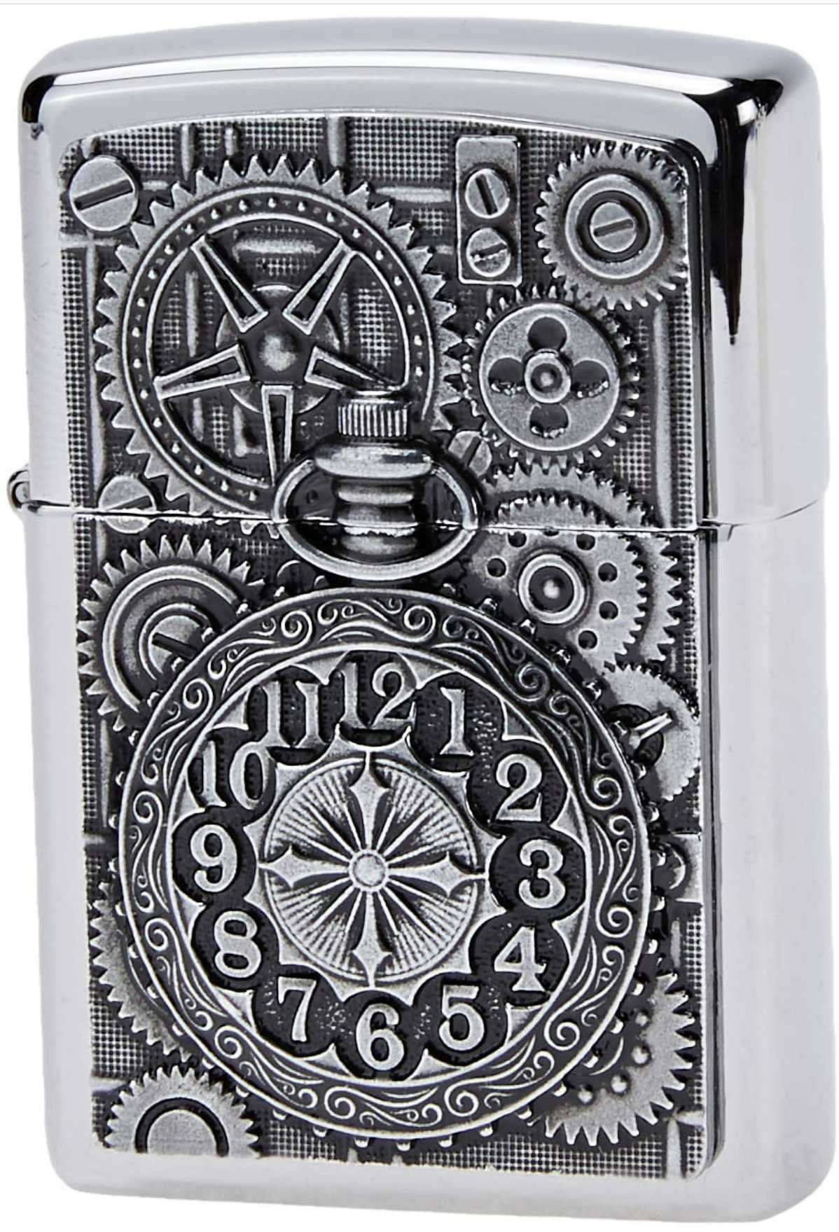
Image: The Zippo lighter open, showing the internal mechanism and the detailed pocket watch design on the case.