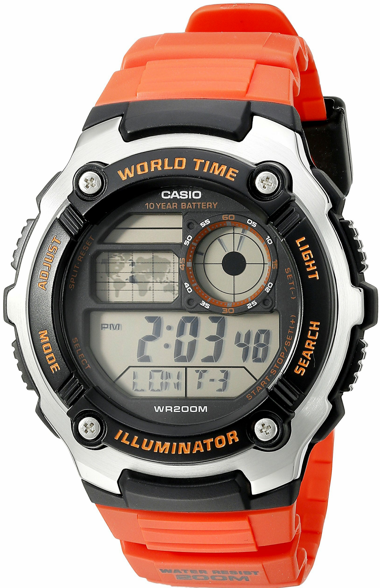
Image: Front view of the Casio AE-2100W-4AV digital watch, showcasing its display and button layout.