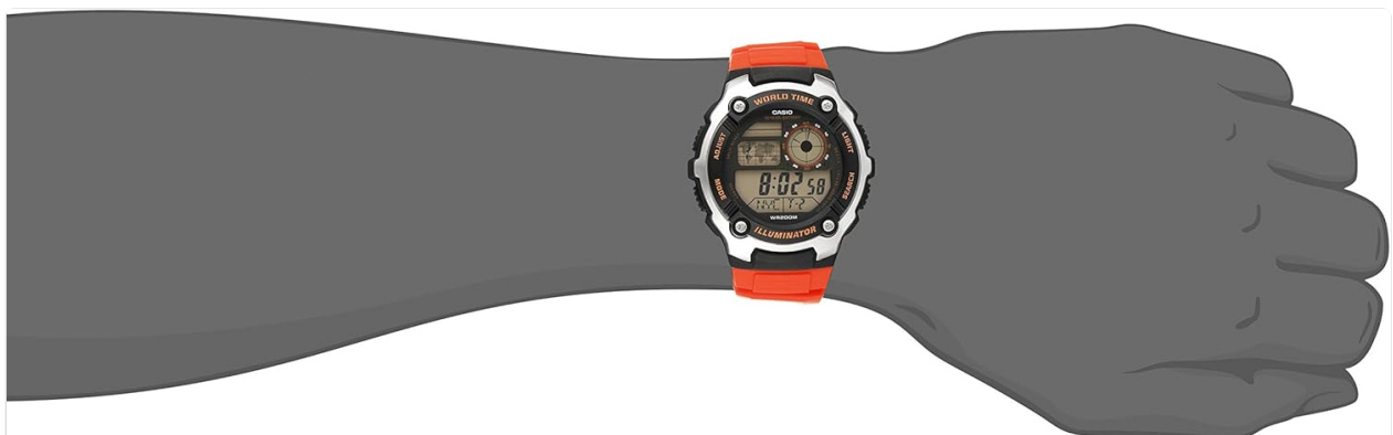
Image: The Casio AE-2100W-4AV watch on a wrist, demonstrating its appearance when worn.