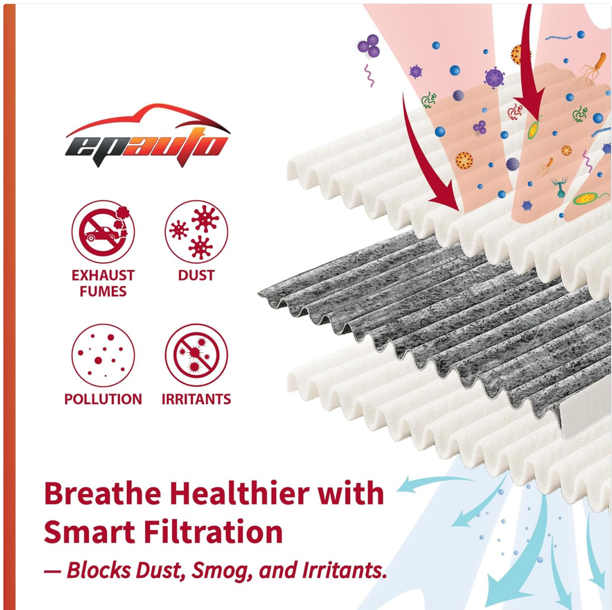
Image: A diagram illustrating the multi-layer filtration process, blocking exhaust fumes, dust, pollution, and irritants.