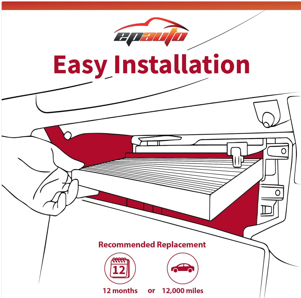
Image: A diagram illustrating the simple process of installing the cabin air filter behind the glove compartment.