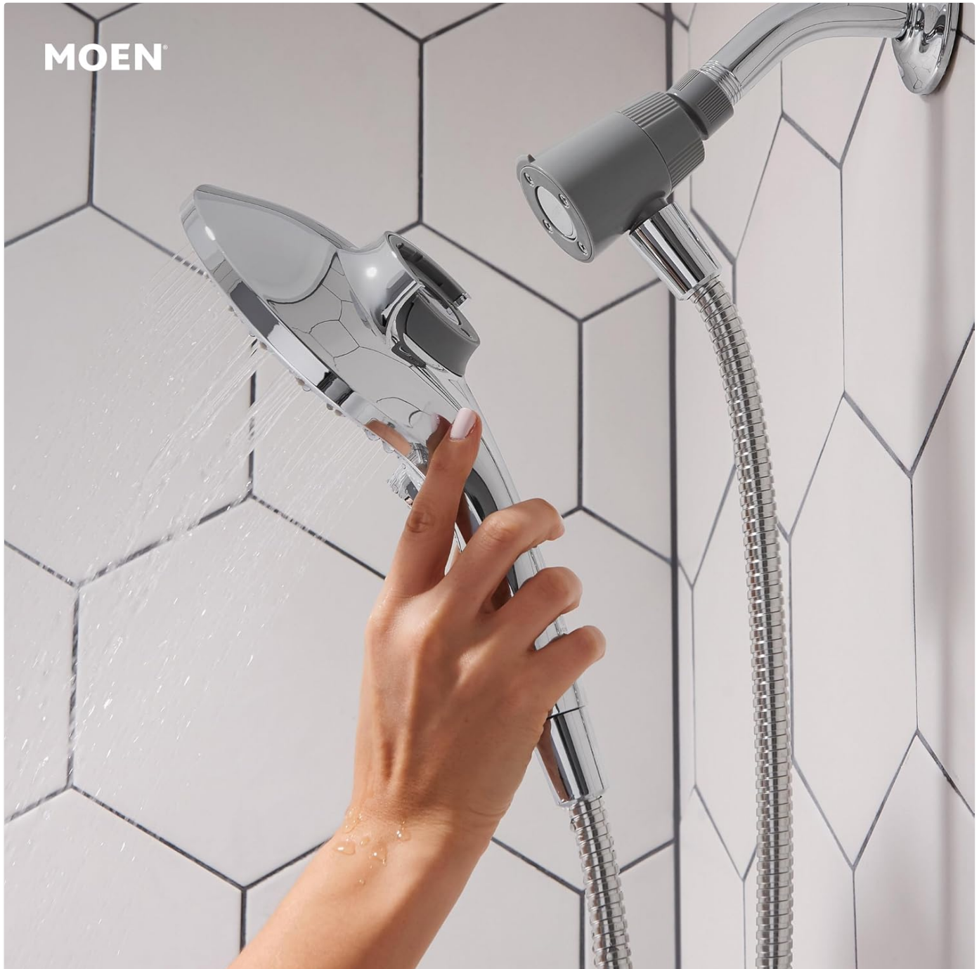
Figure 3: The Magnetix docking system allows for easy detachment and secure reattachment.

To change spray settings, simply turn the dial on the showerhead. The magnetic docking system allows for effortless detachment and reattachment of the handheld unit, ensuring it remains securely in place when not in use.