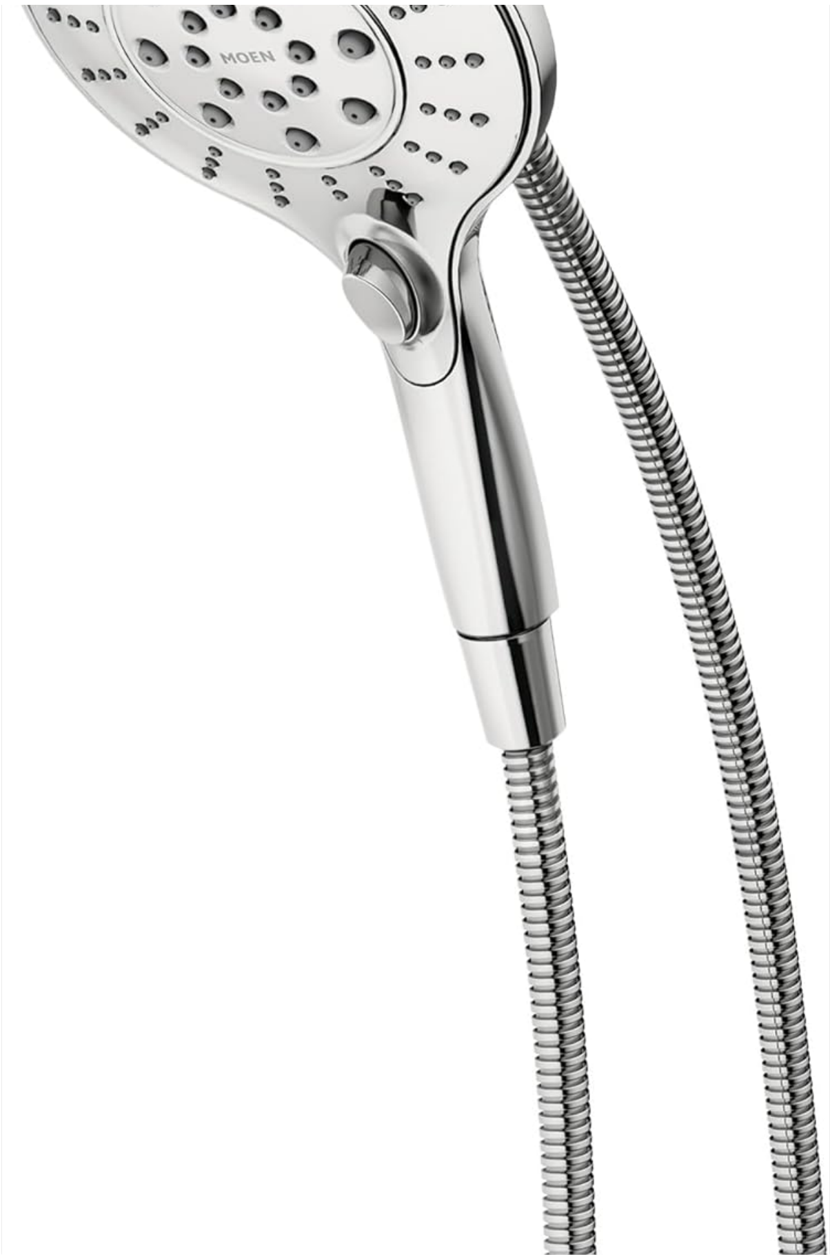
Figure 1: Moen Engage Chrome Magnetix Six-Function Handheld Shower Head with hose and magnetic dock.