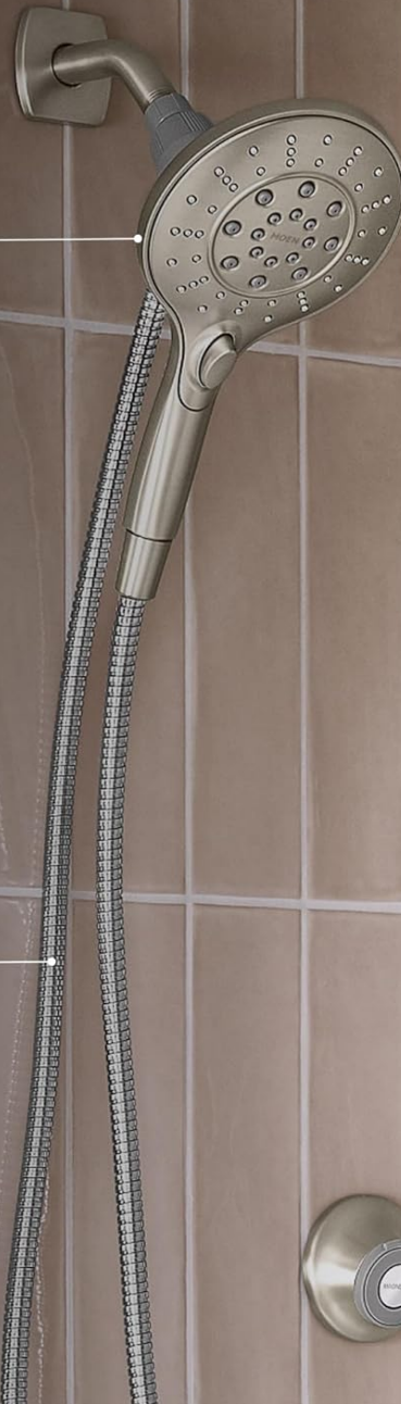
Figure 4: Features of the Moen Magnetix shower head, including magnetic docking and the 60-inch flexible hose for extended reach.

The included 60 inch hose extends for reach and flexibility.