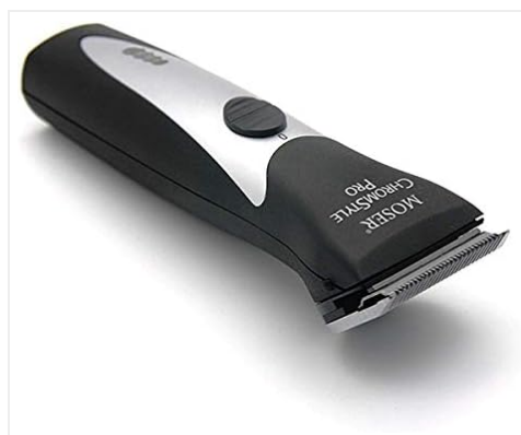
Image: A close-up of the Moser ChromStyle Pro clipper displaying its red, yellow, and green LED indicator lights, which communicate battery charge level and charging status.