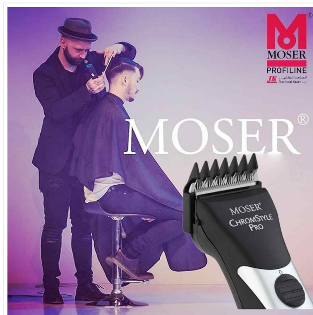
Image: A detailed view of the Moser ChromStyle Pro's Diamond Blade, highlighting its precision cutting teeth and robust construction.

The Diamond Blade is highly resistant and requires less maintenance compared to standard blade sets, offering up to 40 times more durability.