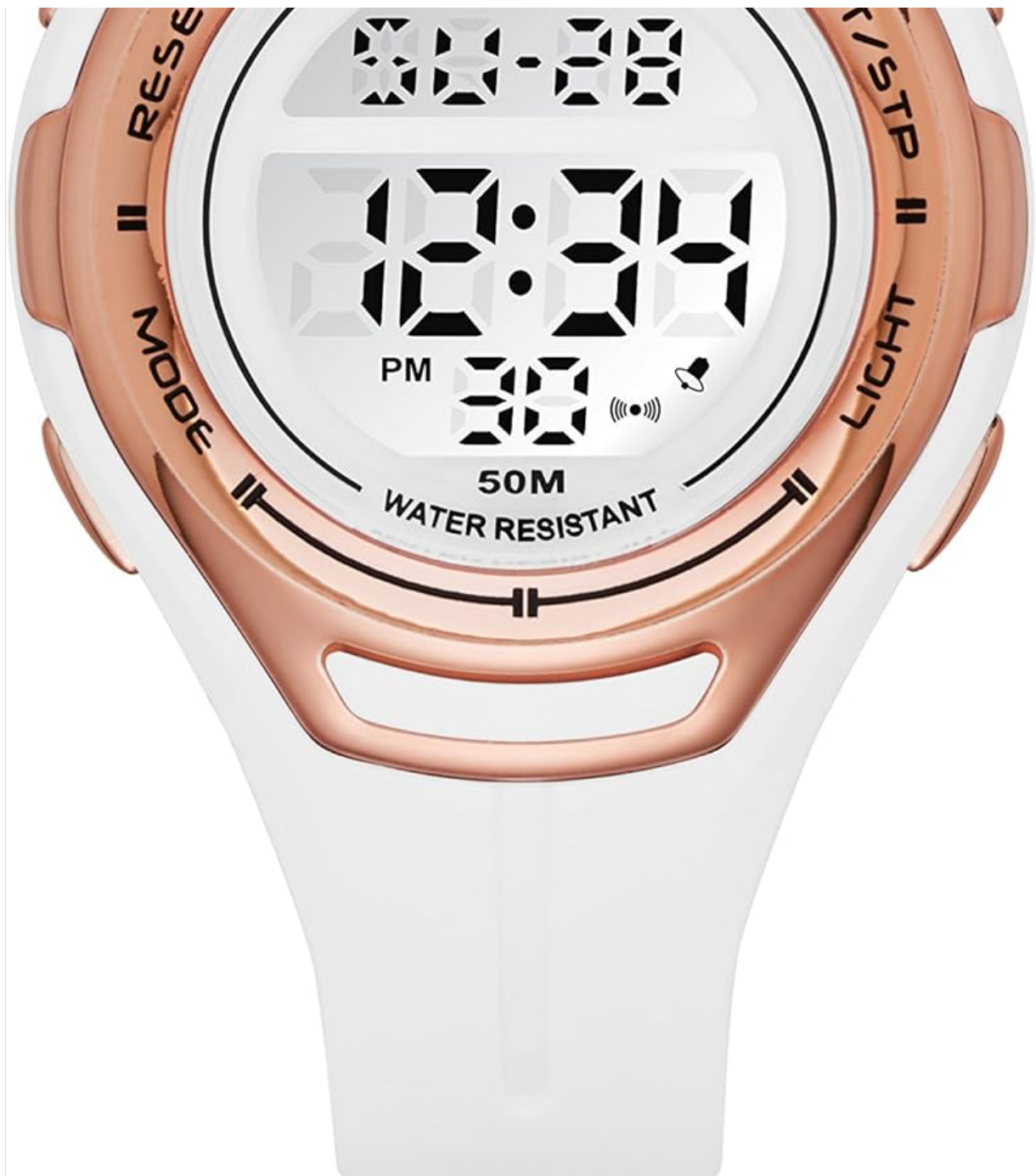
Figure 1: Front view of the Skechers Artesia Digital Sports Watch SR2011. The display shows the time, date, and various mode icons, with 'MODE', 'RESET', 'ST/STP', and 'LIGHT' buttons visible around the rose gold-tone bezel.