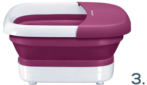
Image 3: The collapsible design allows for easy setup and storage.