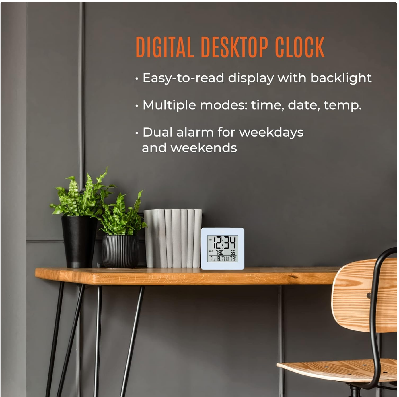
Image 1.1: The Marathon CL030050BL Digital Dual Alarm Clock, showcasing its compact design and clear display on a desk.