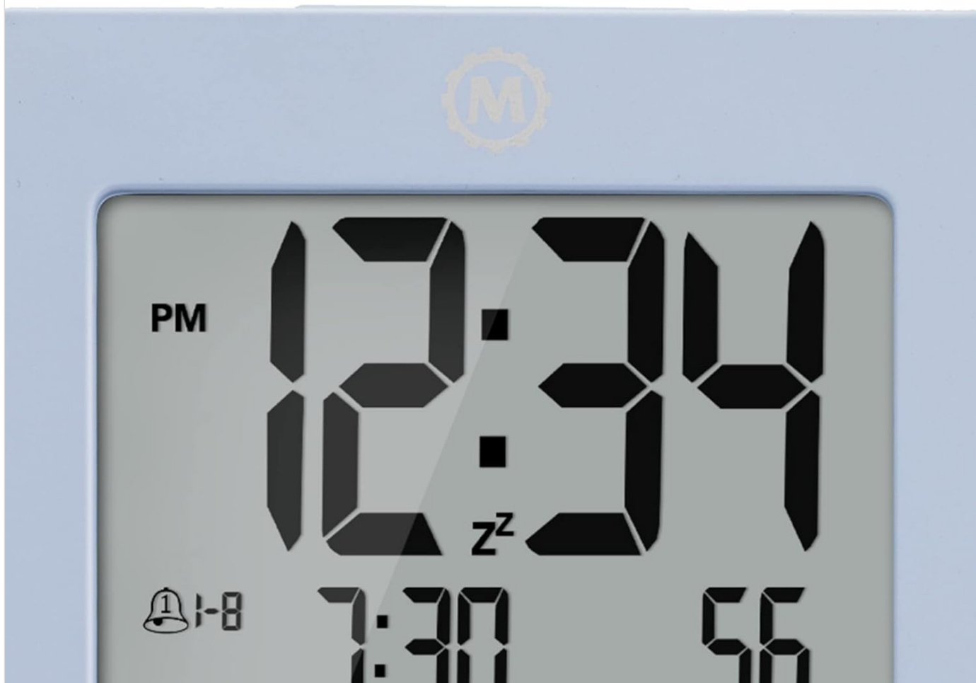
Image 5.1: Dynamic display showing various information including time, alarm status, date, and temperature.

Time (12/24 H) • Day of the Week • Temperature (°C & °F)