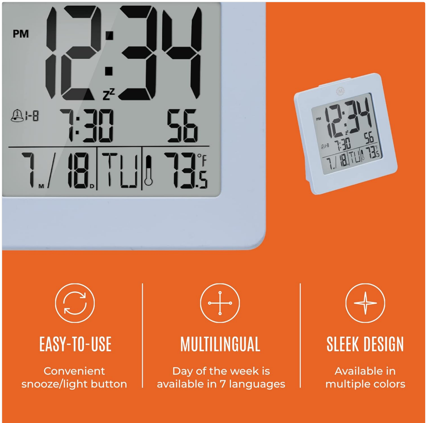
Image 3.1: Detailed view of the clock's display and highlighted features such as ease of use, multilingual support, and sleek design.