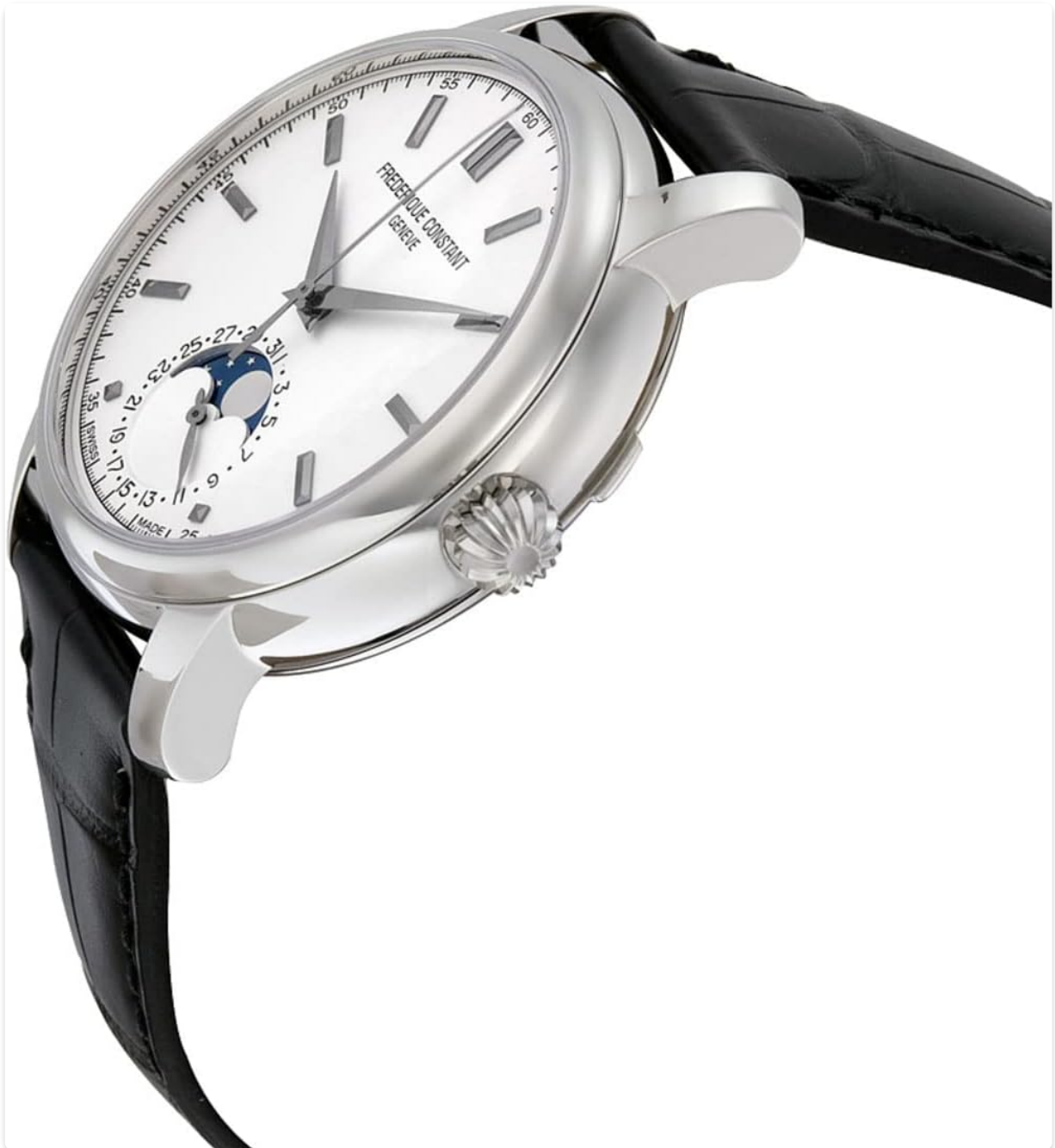
Image 2.2: Side view of the watch, highlighting the fluted crown used for winding and setting.

The crown has multiple positions for setting various functions.