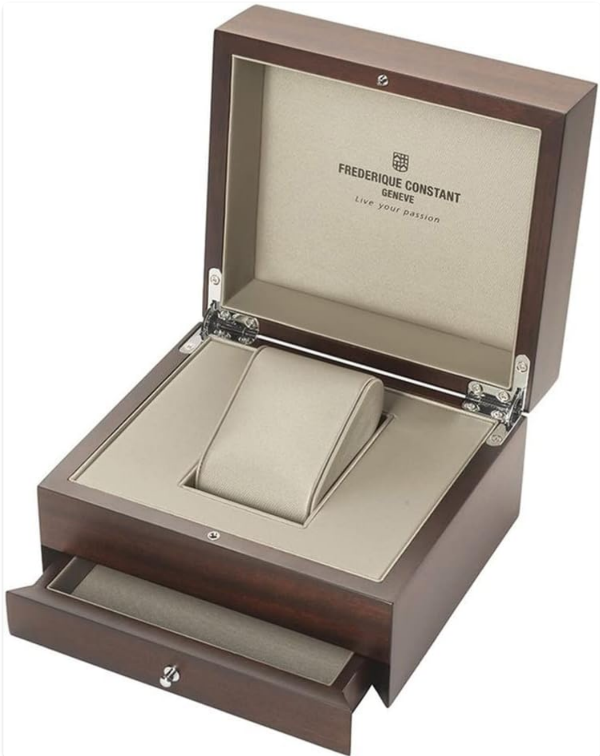
Image 2.1: The Frederique Constant watch box, designed for safe storage and presentation of the timepiece.

Carefully remove your watch from its packaging. Inspect the watch for any visible damage. The watch is typically presented in a protective box.