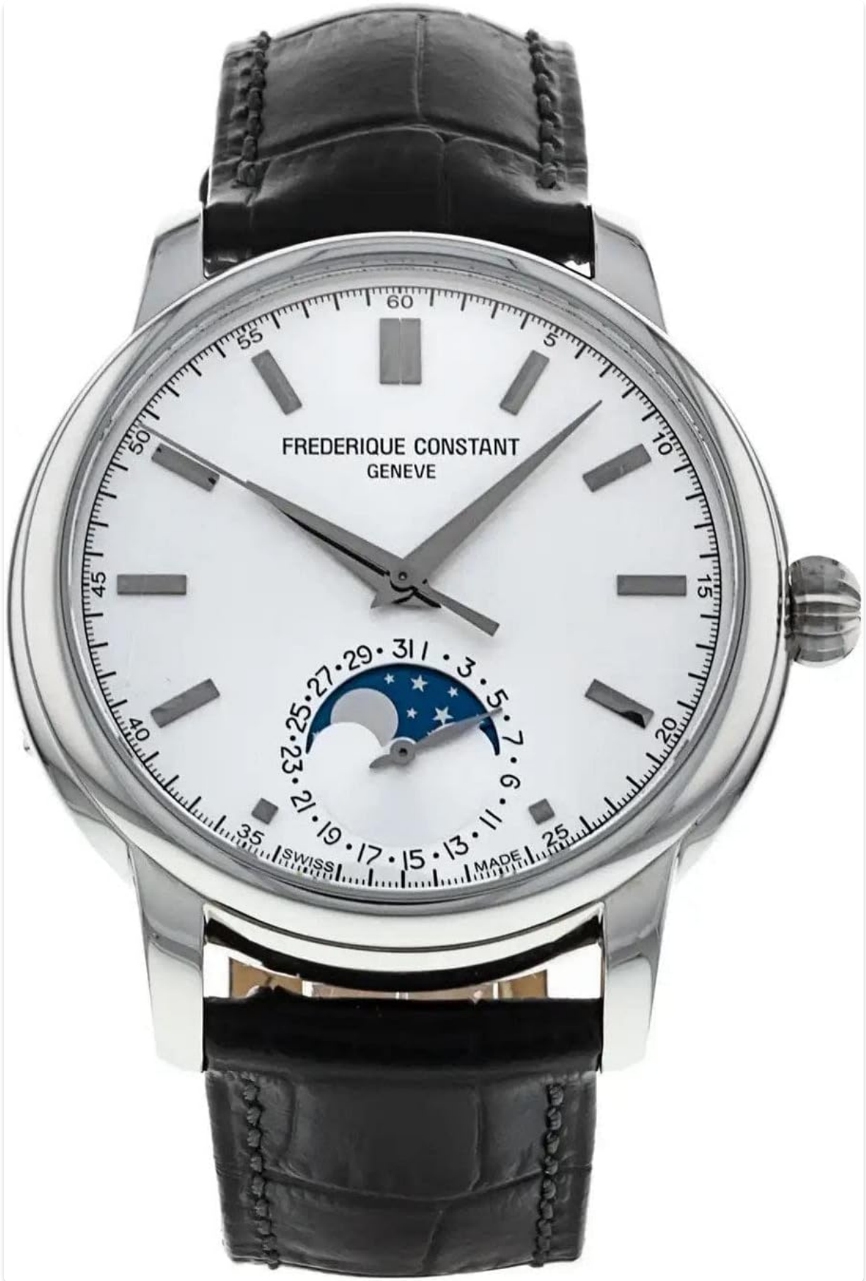
Image 1.1: Front view of the Frederique Constant FC715S4H6 Classics Automatic Watch, showcasing its silver dial, index hour markers, and moon phase complication at 6 o'clock.