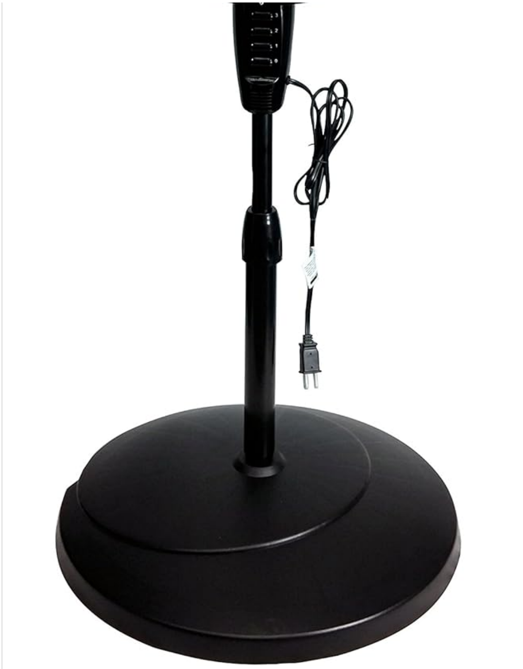
Image: The Hamilton Beach 18-Inch Stand Fan in black, featuring its round base, adjustable pole, and fan head with a metal grill.