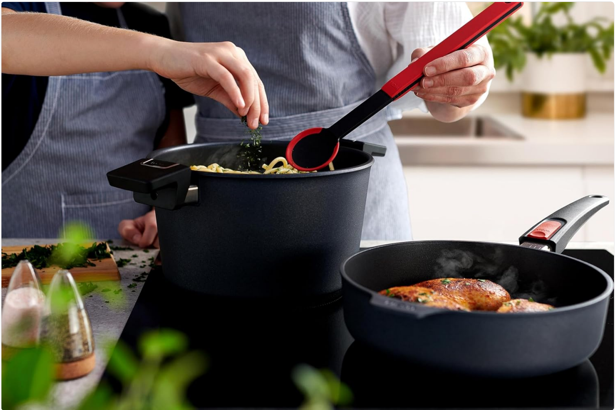
Figure 4.1: The Woll KU004 Cook It Cooking Spoon in use, demonstrating its ergonomic design and utility in a kitchen setting.