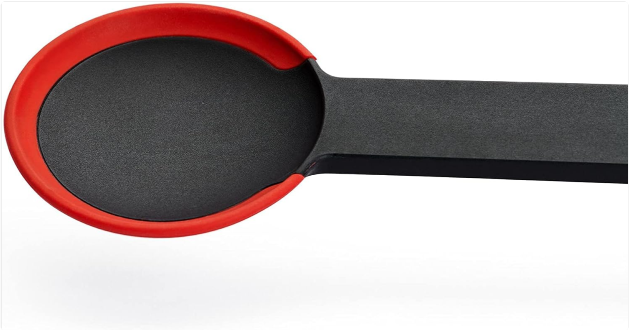
Figure 2.1: Detailed view of the spoon's silicone head and the transition to the fibreglass-reinforced handle, highlighting the flexible lip.