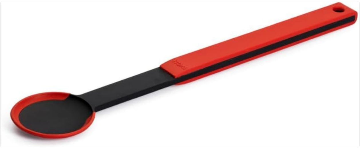
Figure 5.1: Main view of the Woll KU004 Cook It Cooking Spoon, highlighting its design and the hanging hole on the handle.