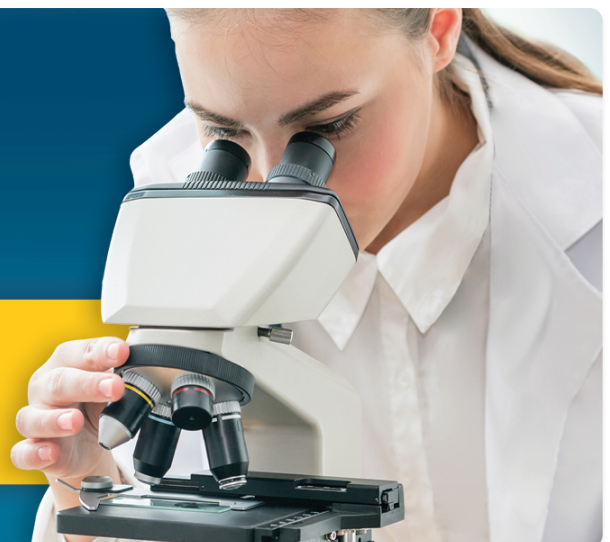
Image: Certifications and quality assurances, including IFOS and heavy metal testing.

We use a combination of small fish (like sardines, anchovies and mackerel), known to have less accumulation of mercury and other toxins than some bigger fish. Our softgels are gluten-free, Non-GMO and also IFOS Certified for quality, purity and potency, so you can be sure you're getting the highest quality