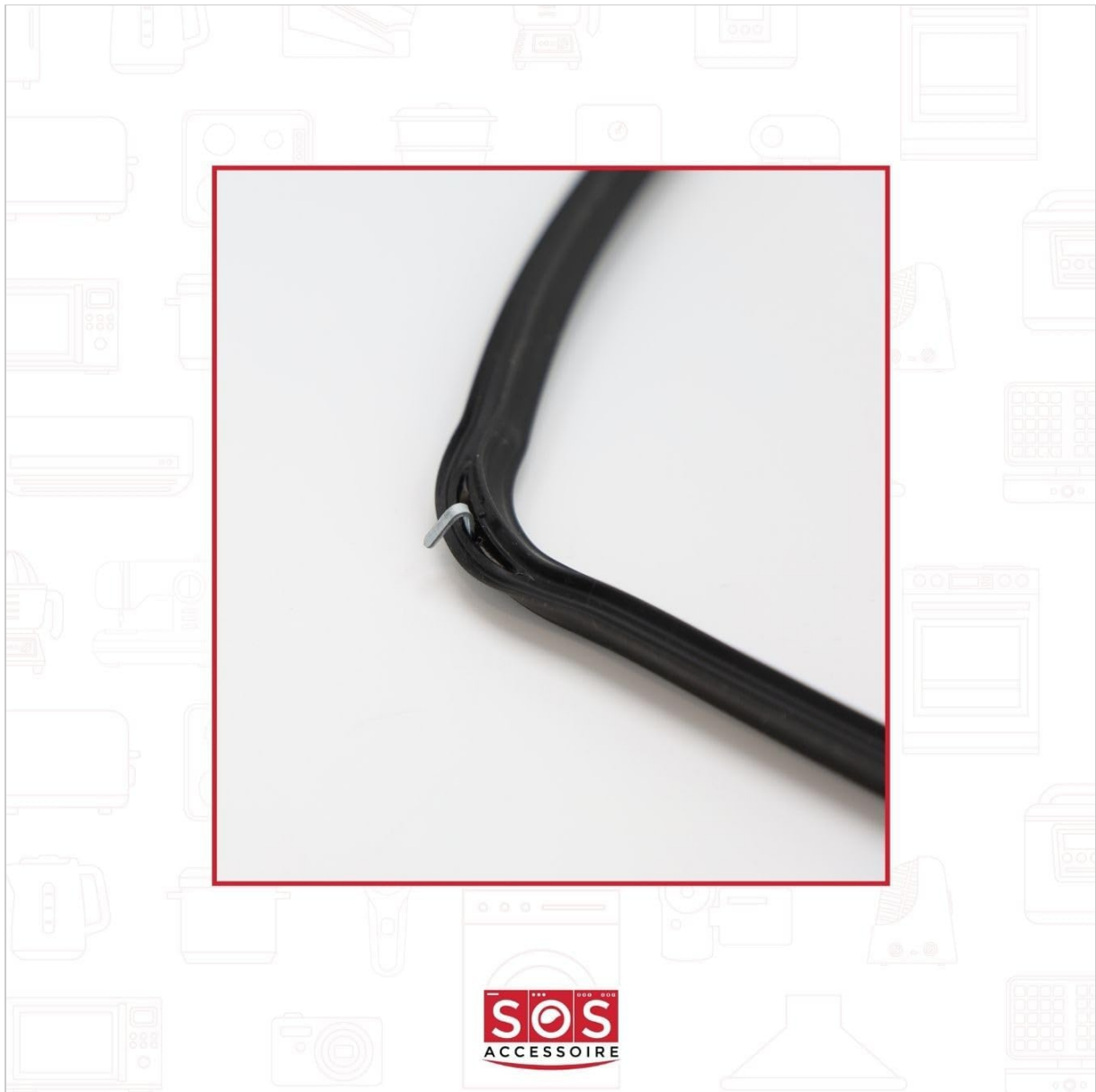
Image 2: Detail view of a corner clip on the Beko Oven Door Seal Gasket, designed for secure fastening.