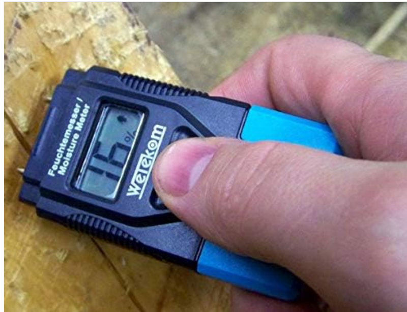
Figure 2: The digital LCD display showing a moisture reading of "1.6%". The device is held by a hand, with the measurement pins inserted into a wooden surface.