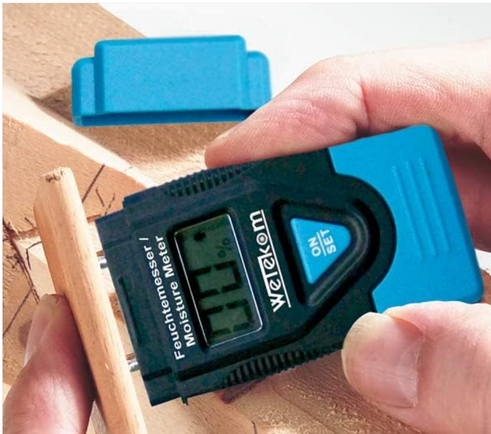
Figure 1: Wetekom Wood Moisture Meter K459 in operation. The image shows the compact device with its blue protective cap removed, revealing the two sharp measurement pins. The digital LCD screen displays a percentage reading, and a blue "ON/SET" button is visible. A hand is holding the device, pressing the pins into a piece of wood.