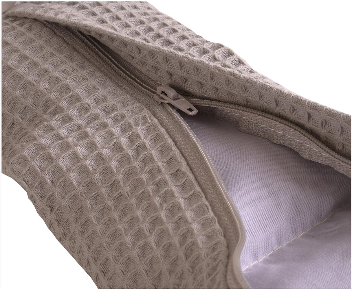
Image: The scarf wrap comfortably positioned around the neck and shoulders for therapy.