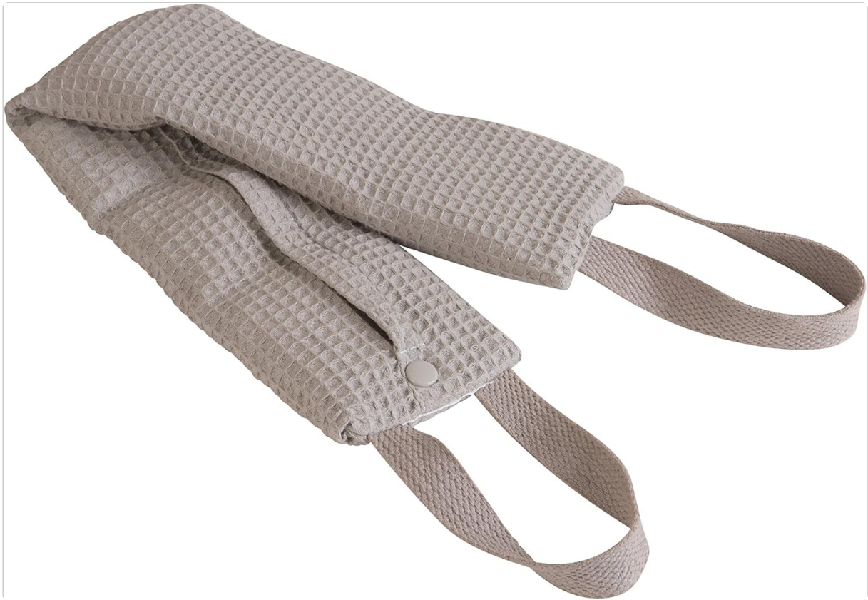
Image: The Vivi Relax-a-Bac Scarf Wrap ready for use.