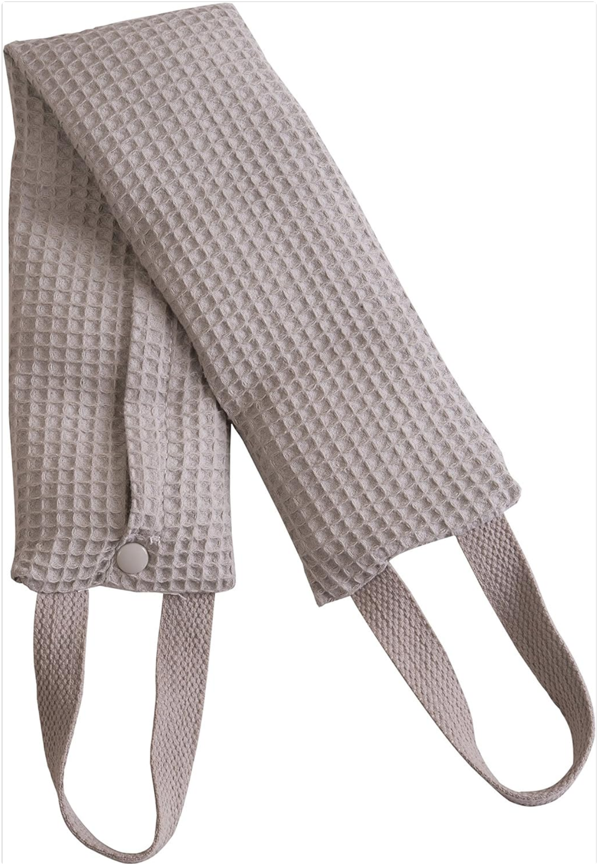
Image: Natural kiln-fired clay beads provide excellent heat retention for moist heat therapy.