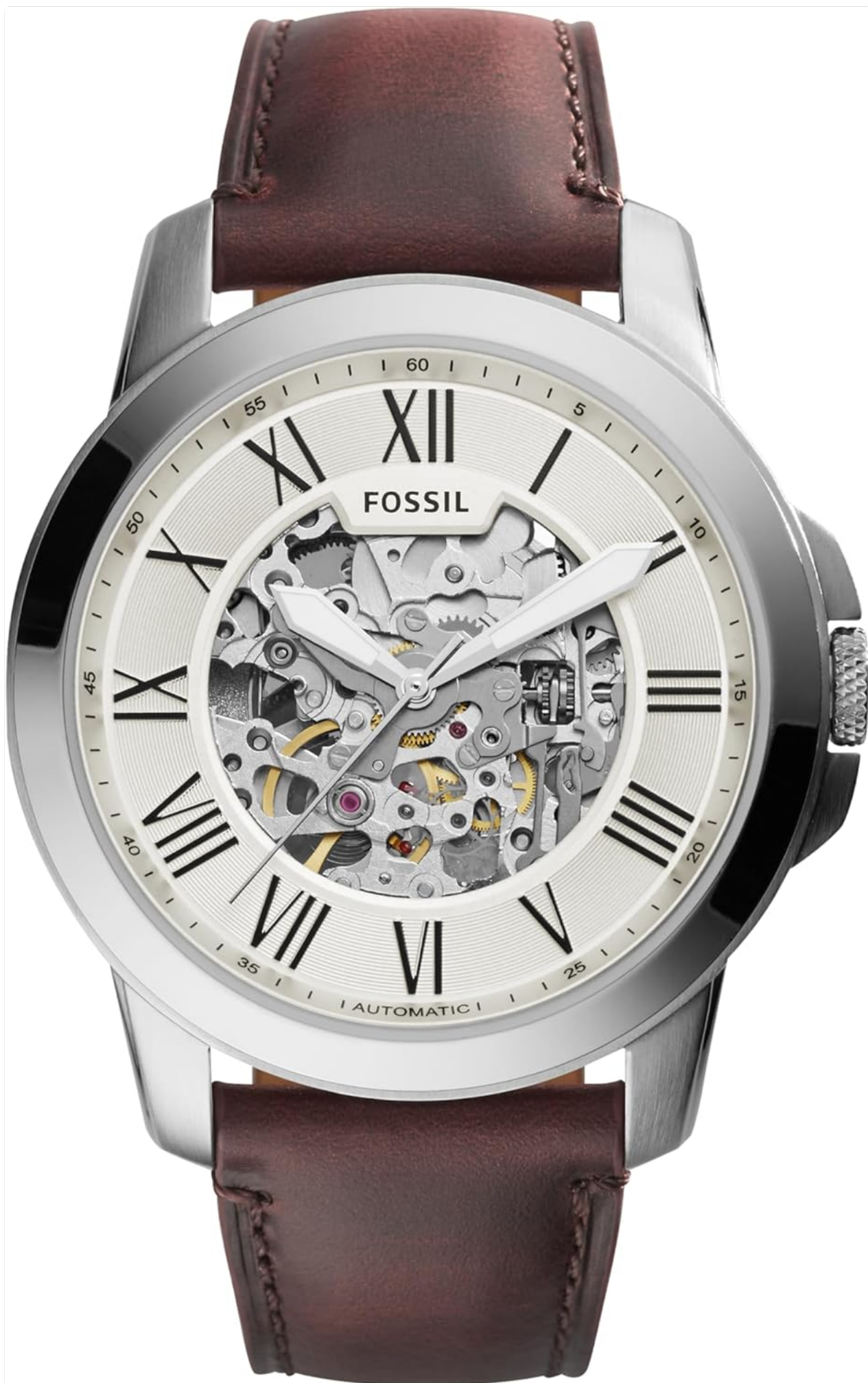
Image 1.1: Front view of the Fossil Men's Grant Automatic Watch, showcasing the silver case, brown leather strap, and skeleton dial.