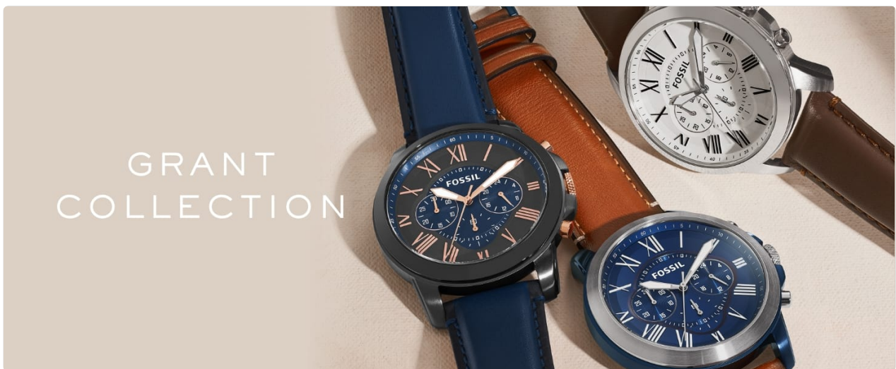
Image 7.3: An overview of various watches from the Fossil Grant Collection, showcasing design consistency.