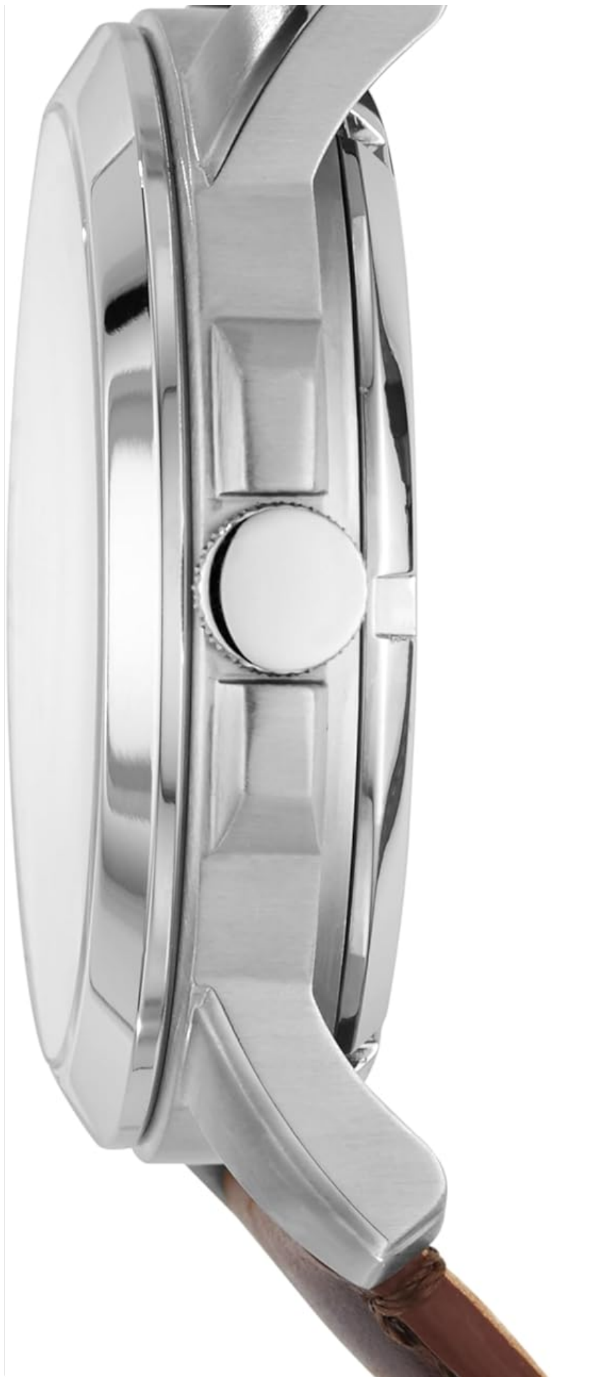
Image 3.1: Side view of the watch, highlighting the crown and case thickness.