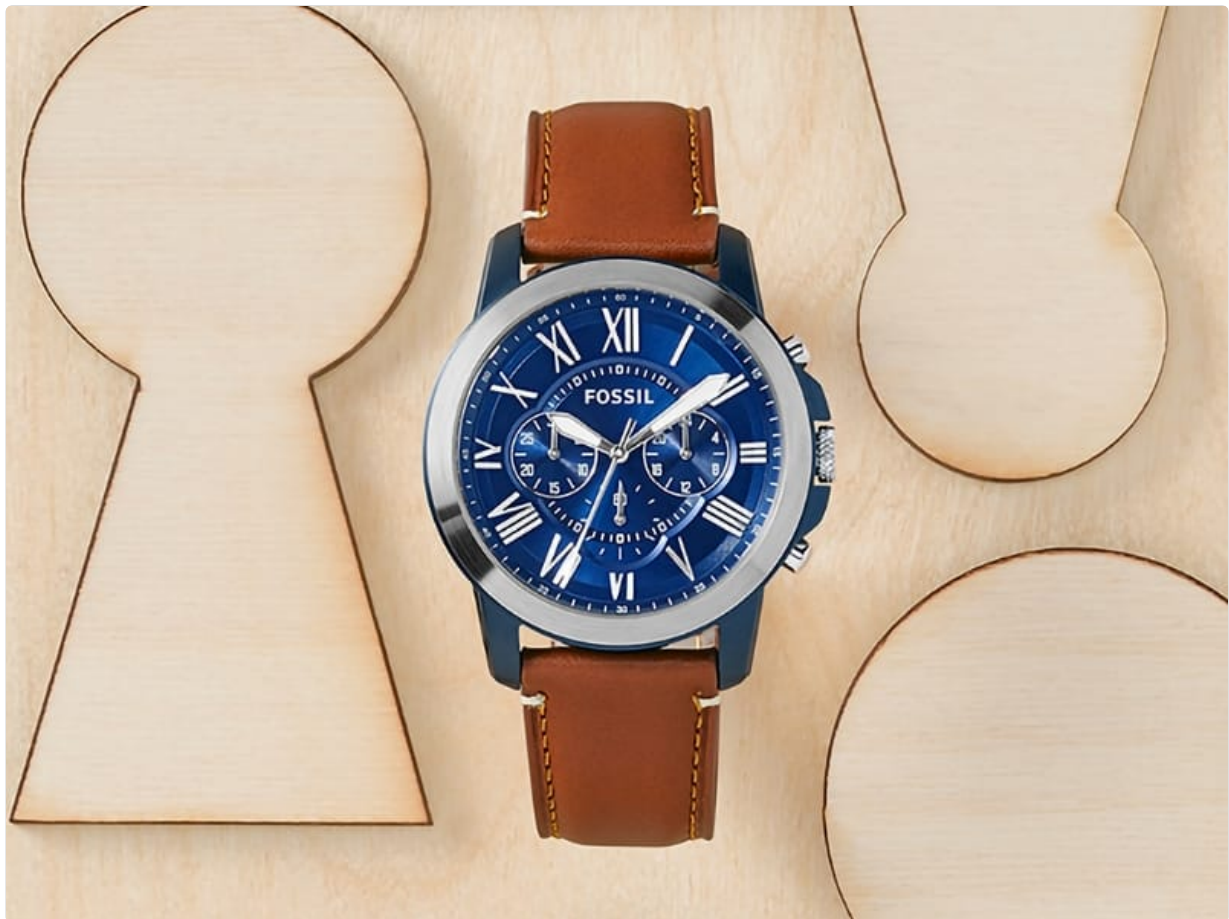
Image 7.2: A detailed shot of the watch face, highlighting the Roman numerals and sub-dials.