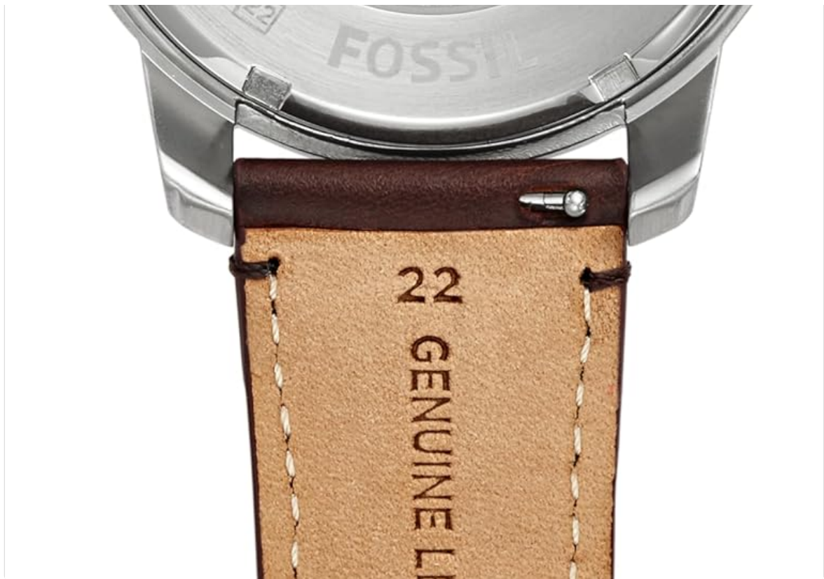
Image 2.1: Rear view of the watch, showing the transparent case back that reveals the automatic movement and internal components.