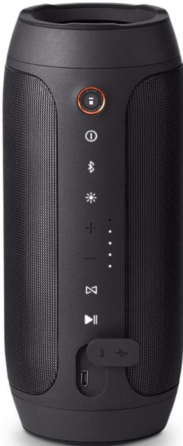
Image: Rear view of the JBL Pulse 2 speaker, showing the power button, Bluetooth pairing button, light mode button, volume controls, play/pause button, JBL Connect button, AUX input, and micro USB charging port.