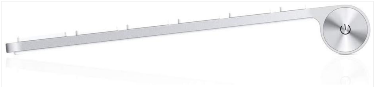
Image: Side view of the Apple Wireless Keyboard, highlighting the circular battery compartment on the right end. The cap is designed to be opened with a coin or flat tool.