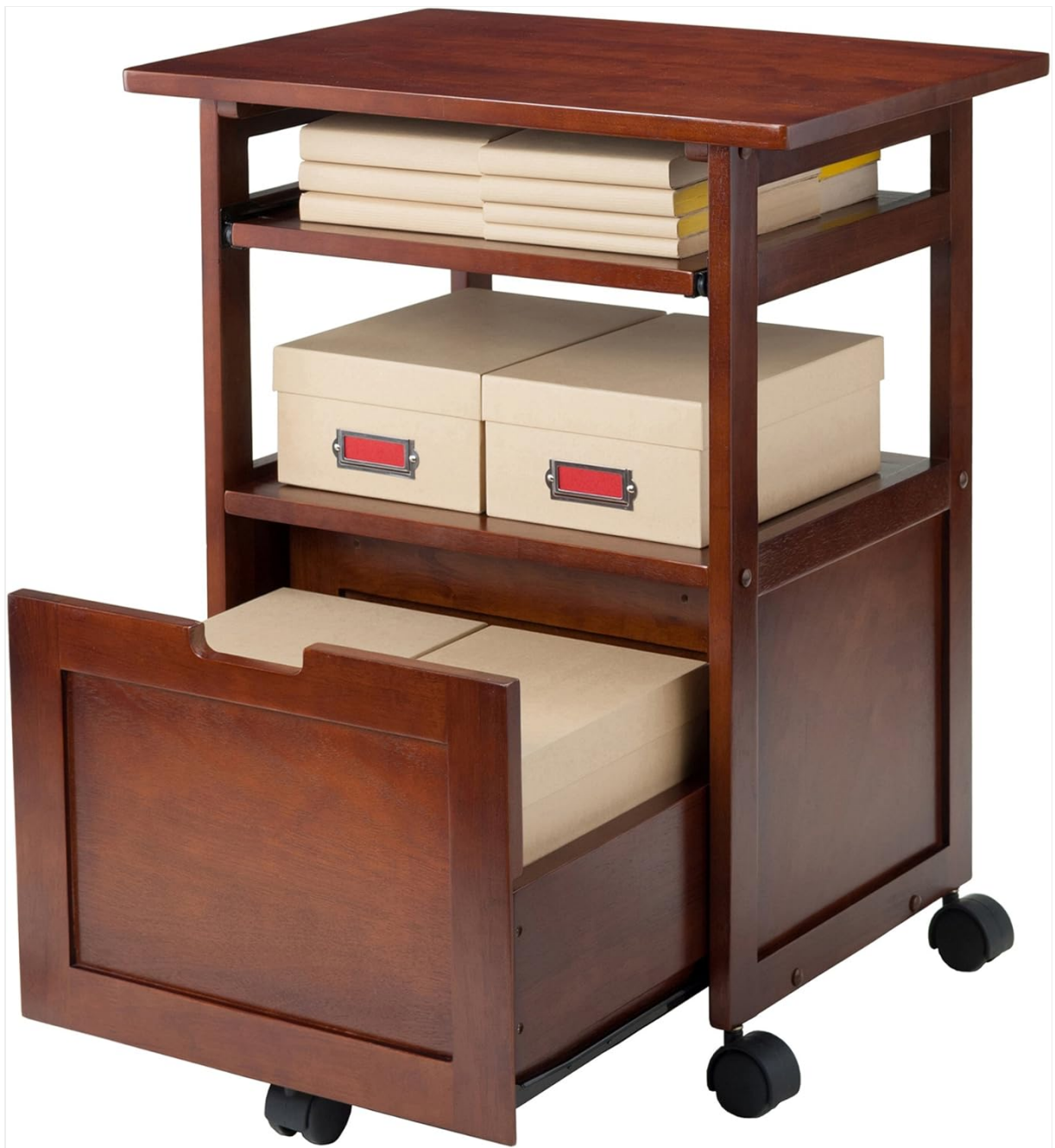
Image: The Winsome Piper Printer Stand with its bottom drawer open, revealing hanging file folders for organized document storage.