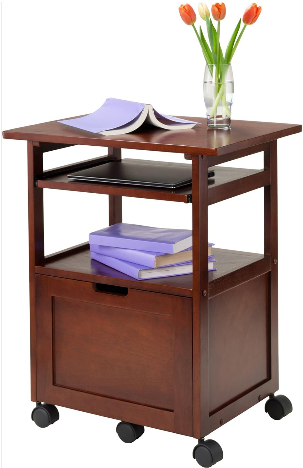
Image: The Winsome Piper Printer Stand with a laptop placed on its extended pull-out tray, demonstrating its use as a workstation.