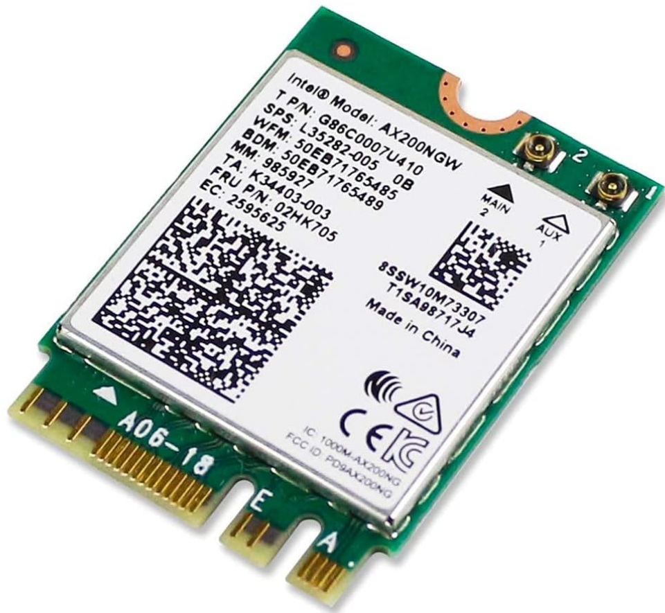
Image: Depiction of Wi-Fi signals (2.4GHz and 5GHz) and the prominent Bluetooth 5.1 logo, indicating dual functionality.