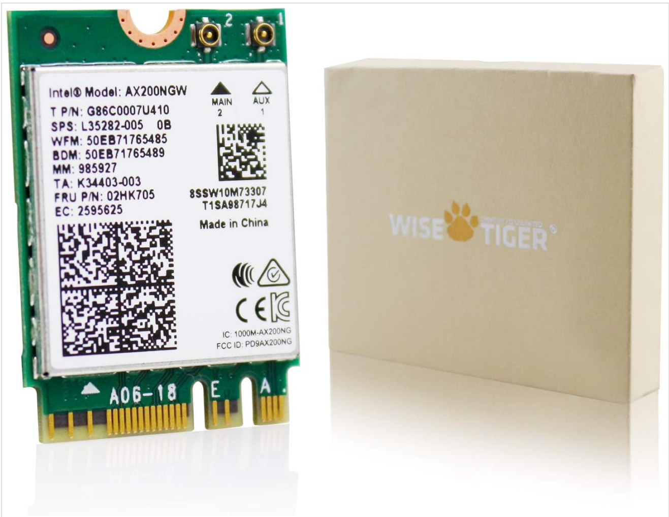
Image: The WISE TIGER AX200NGW Wireless Card shown alongside its compact retail packaging.