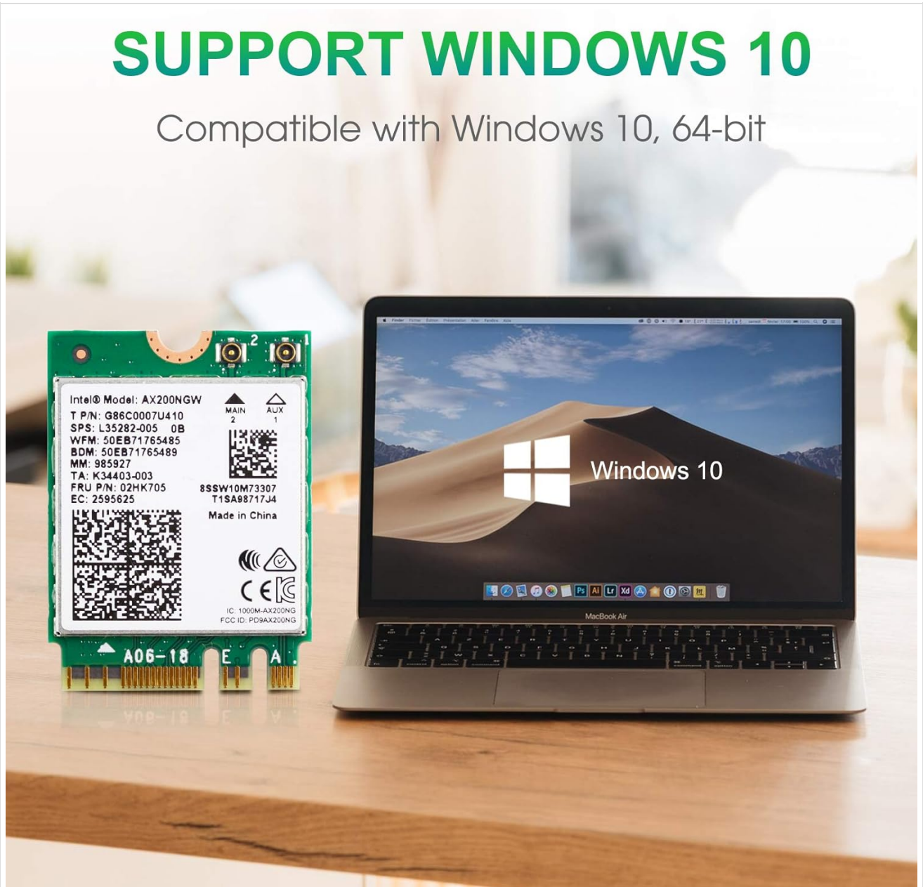
Image: The AX200NGW card positioned next to a laptop screen showing the Windows 10 operating system, emphasizing compatibility.