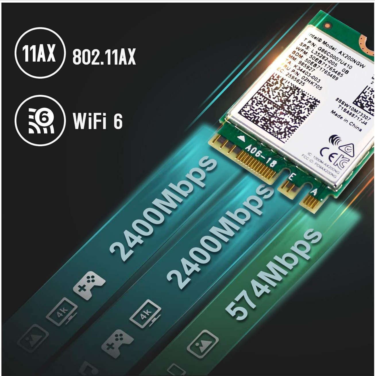
Image: Visual representation of the high-speed data transfer capabilities of the AX200NGW card, highlighting 2400Mbps and 574Mbps speeds.