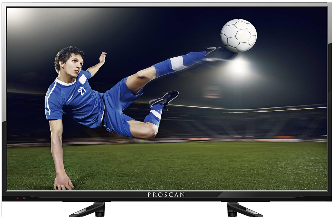
Figure 2.1: Proscan PLDED3280A 32-Inch 720p LED TV.