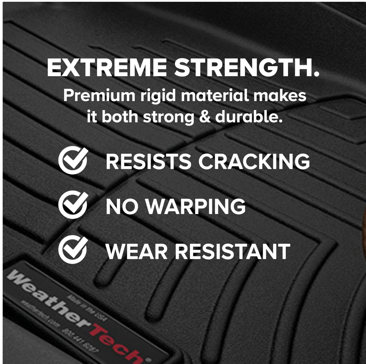
Image 4: Illustrates the extreme strength and durability of the FloorLiner material, emphasizing its resistance to cracking, warping, and wear.