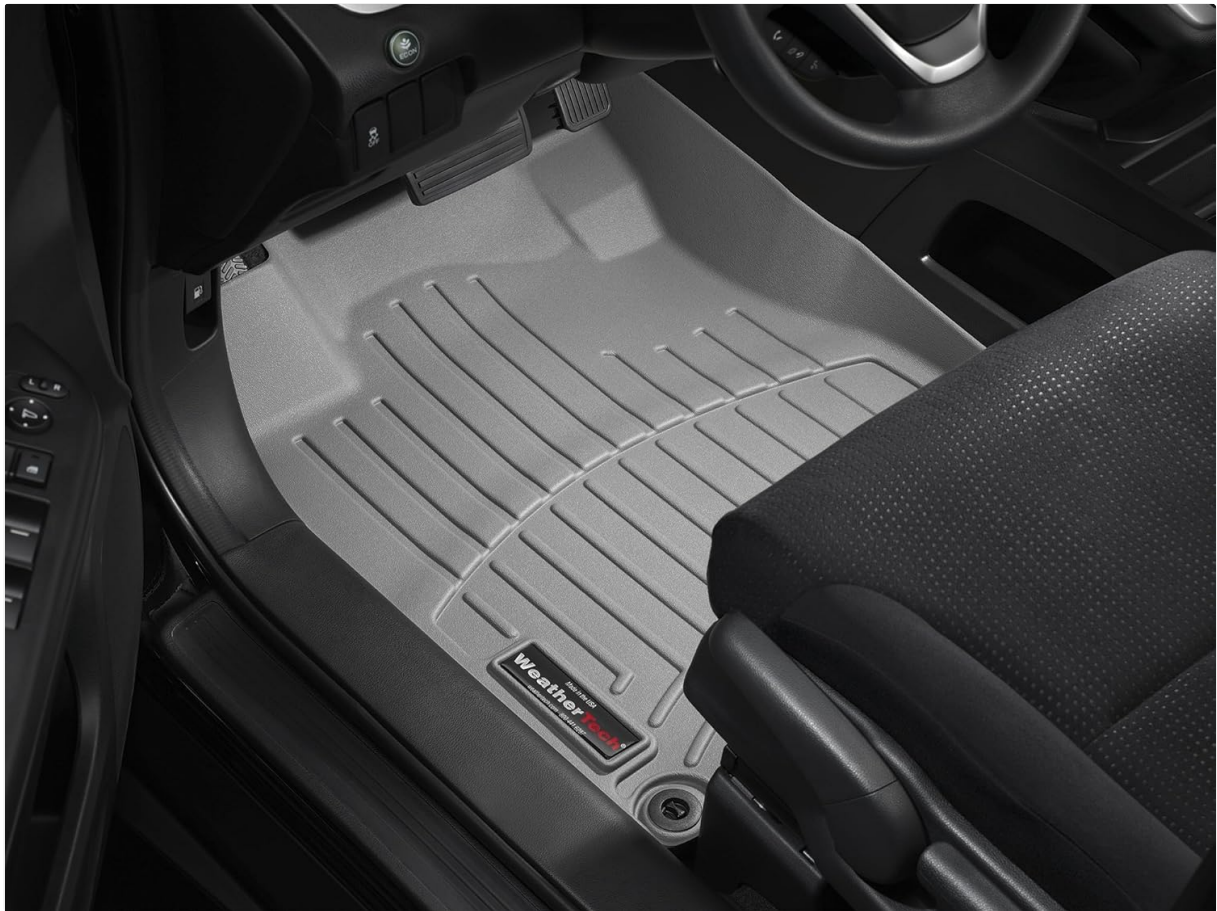
Image 5: A WeatherTech FloorLiner correctly installed in the driver's side footwell, demonstrating its precise fit and coverage.