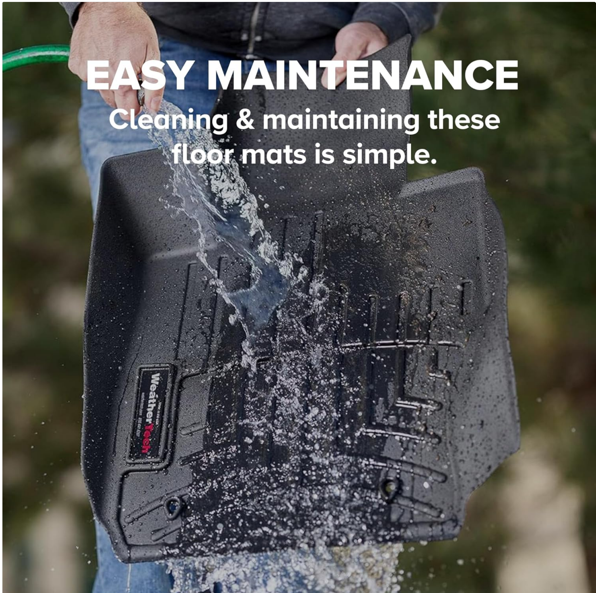
Image 6: A WeatherTech FloorLiner being cleaned with a hose, demonstrating the ease of maintenance.