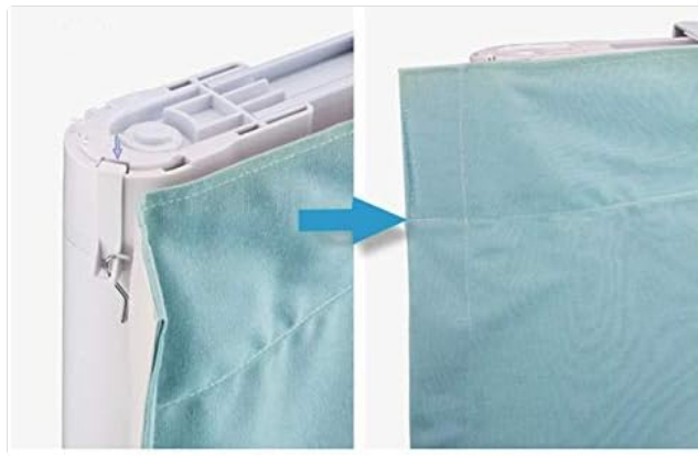
Curtain Attachment: Detail of how curtains connect to the track runners.