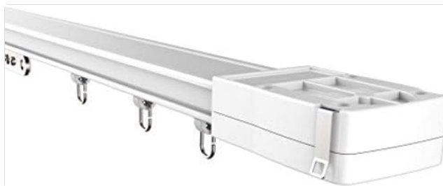
Assembled Track: The complete track system with the motor unit attached.

After power-on, the system may require initial calibration to set the open and close limits. Refer to the remote control section for programming instructions to define the full open and full closed positions of your curtains.