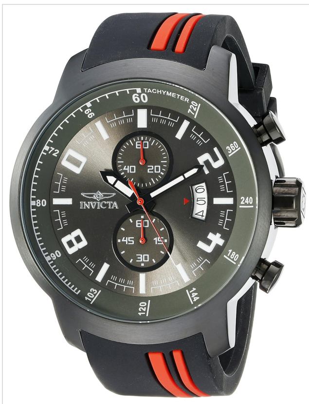
Image: Front view of the Invicta S1 Rally Analog Watch, Model 20218, showcasing its grey dial, chronograph subdials, and black and red strap accents.

This manual provides detailed instructions for the proper setup, operation, and maintenance of your Invicta S1 Rally Analog Watch, Model 20218. This timepiece features a 51 mm ion-plated stainless steel case, a flexible polyurethane strap, 100-meter water resistance, and a two-subdial chronograph function. Please read this manual thoroughly to ensure optimal performance and longevity of your watch.