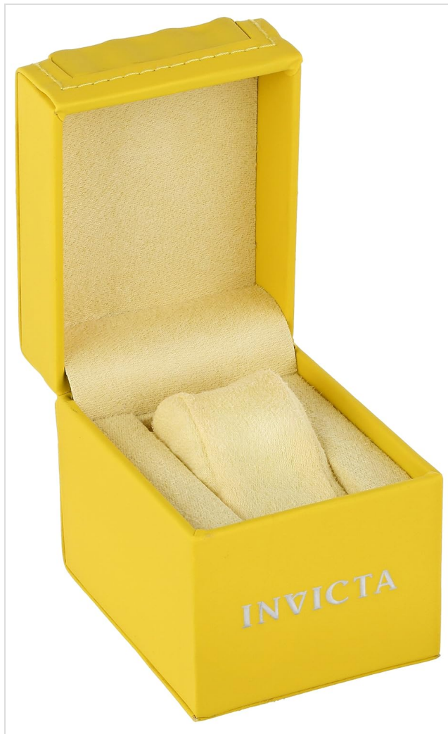
Image: The yellow Invicta branded watch box, indicating original packaging.