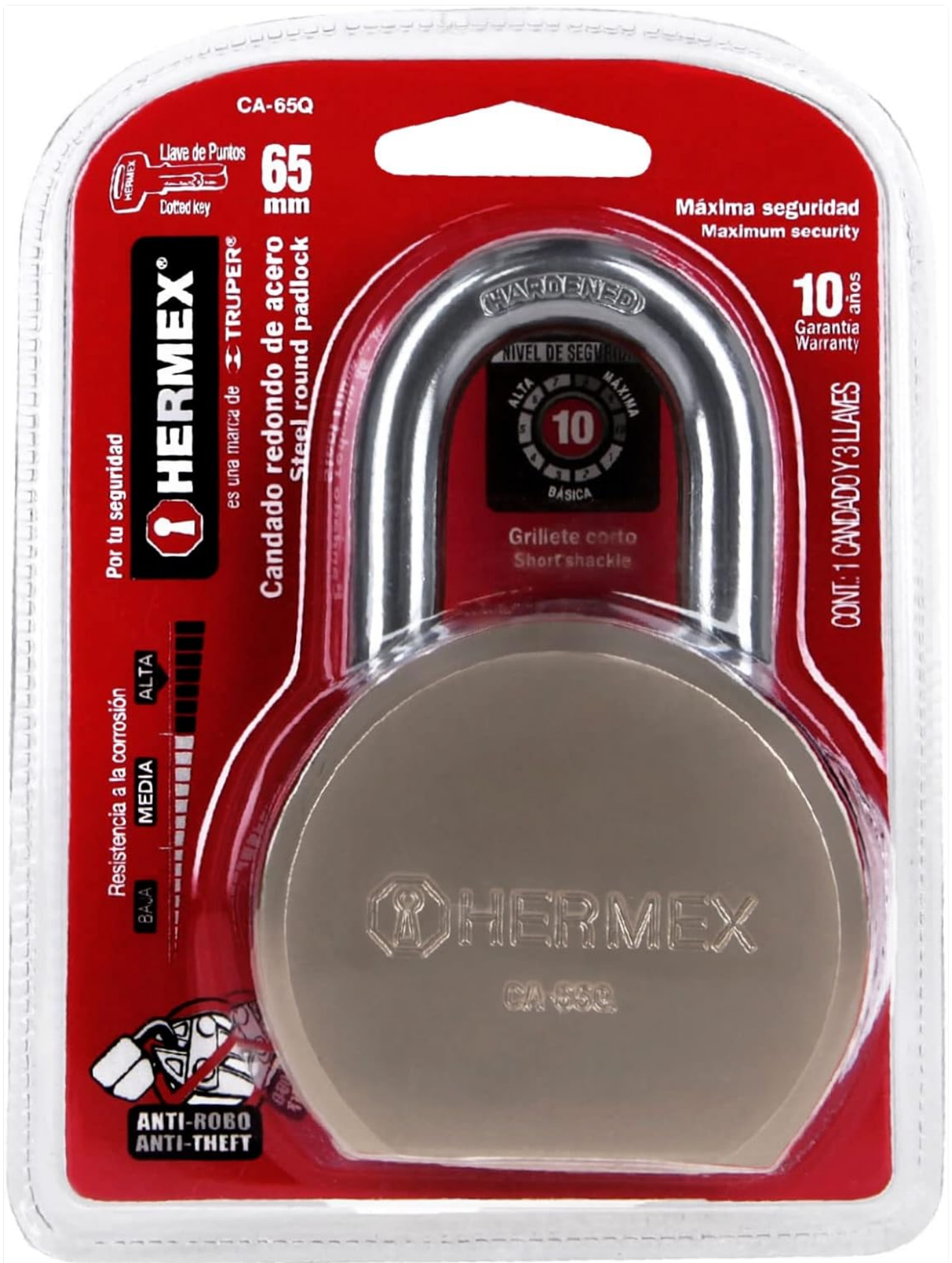
Image: The Hermex CA-65Q padlock shown in its original blister packaging, highlighting the included keys and product details.