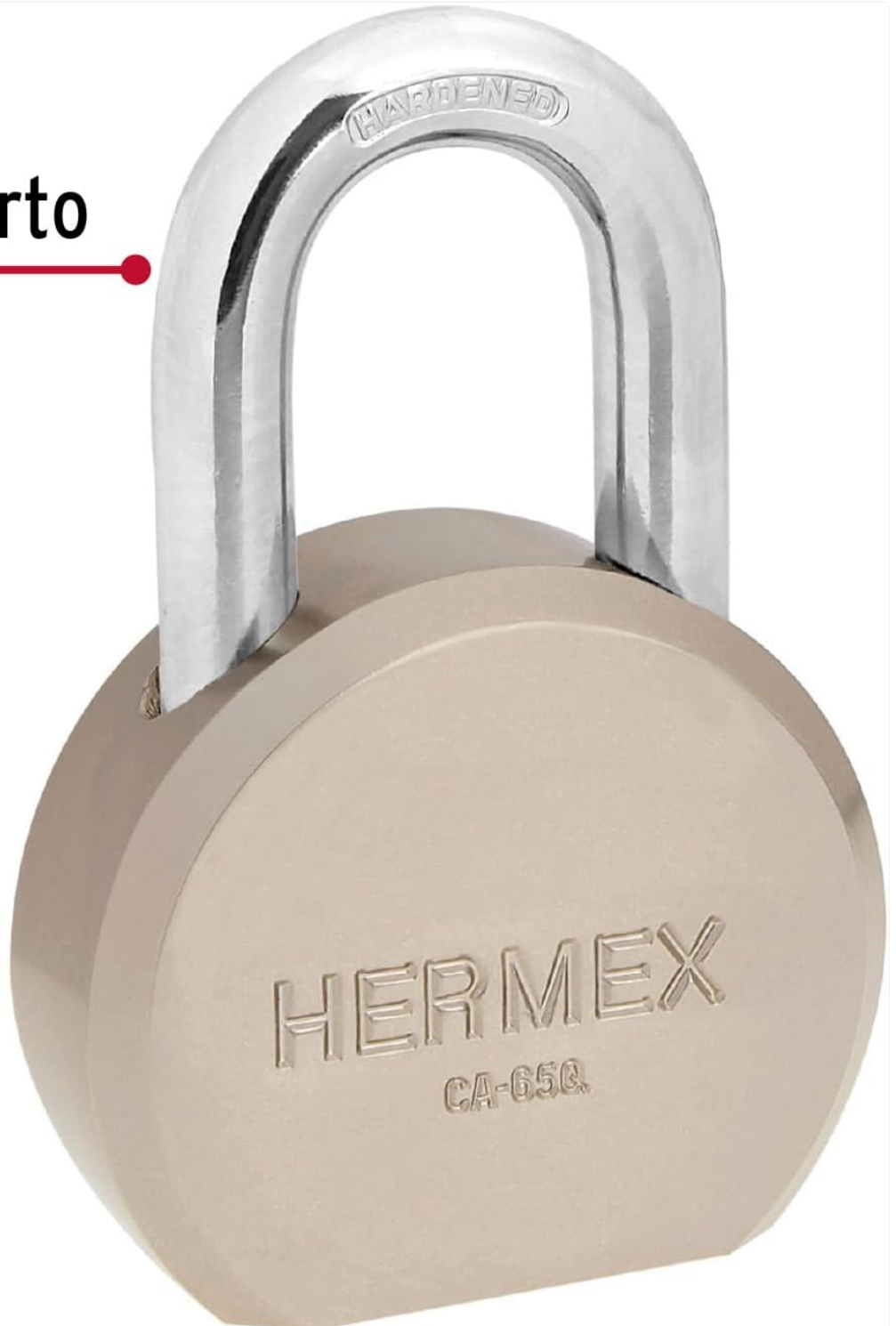
Image: Front view of the Hermex CA-65Q padlock with its shackle in the open position, ready for use.