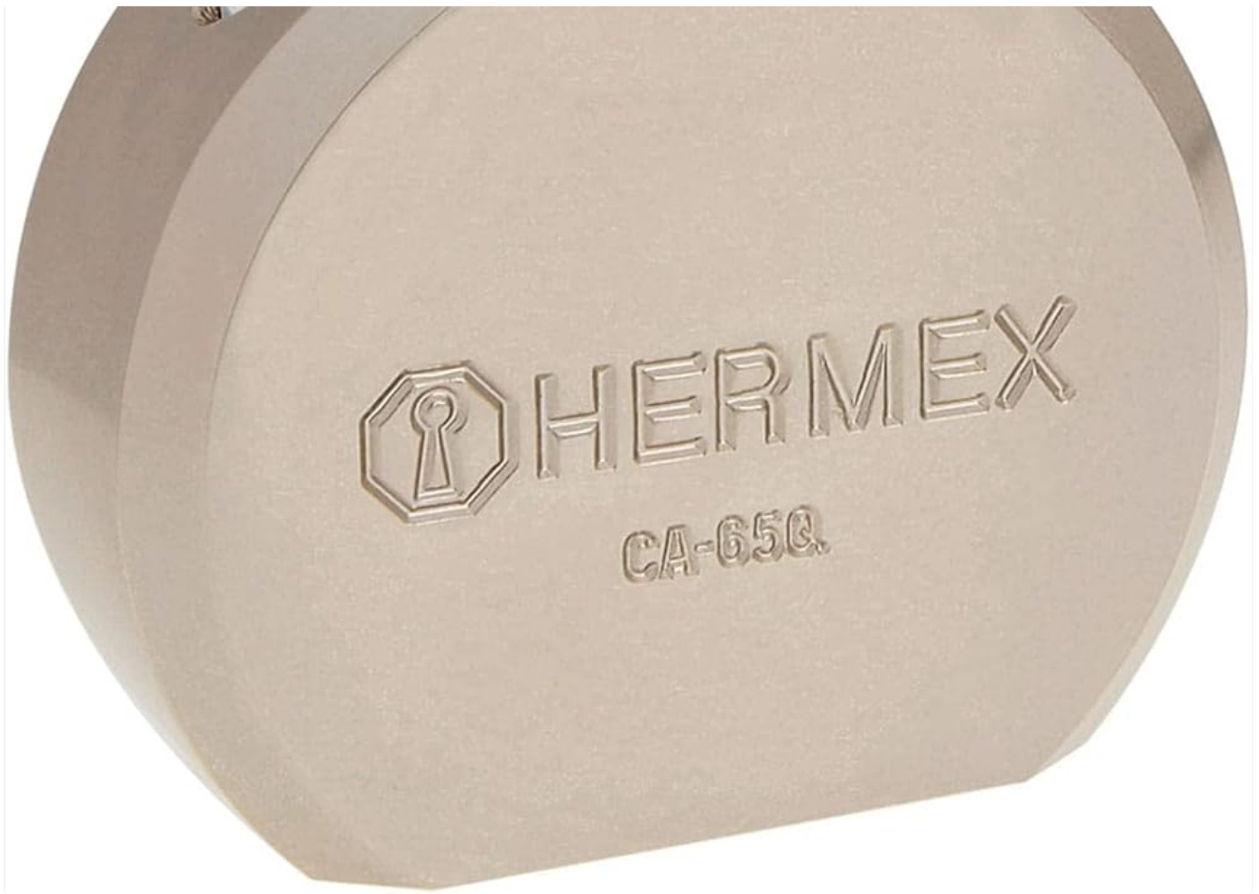
Image: Front view of the Hermex CA-65Q round padlock, showcasing its chrome-matt finish and hardened shackle.