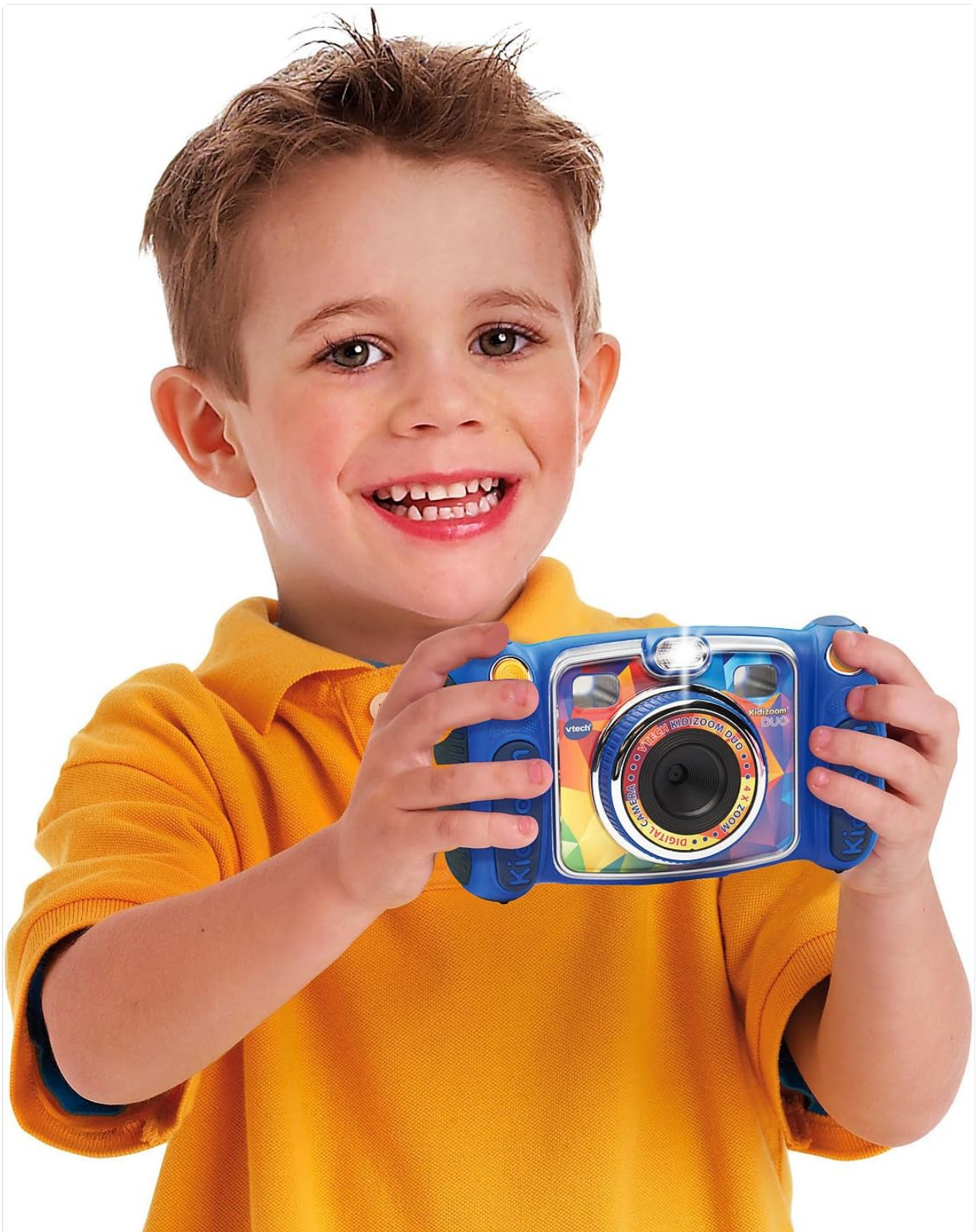
Image: A young child demonstrating how to hold and operate the VTech Kidizoom Duo Digital Camera.