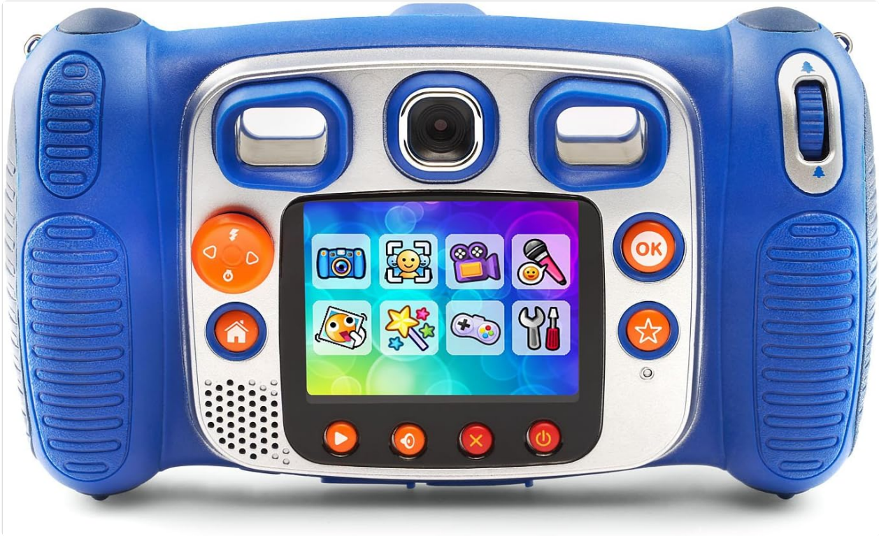
Image: Rear view of the VTech Kidizoom Duo Digital Camera, illustrating the screen and control buttons, where the battery compartment is located.

Note: The camera is not rechargeable. Do not attempt to charge the camera or use rechargeable batteries unless specifically designed for this device.