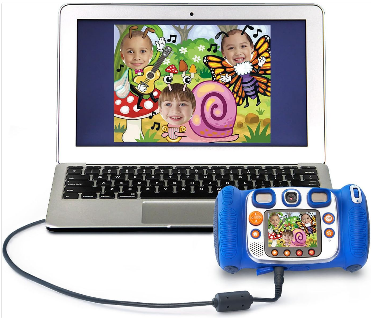
Image: The VTech Kidizoom Duo Digital Camera connected to a laptop, illustrating the process of transferring media files.