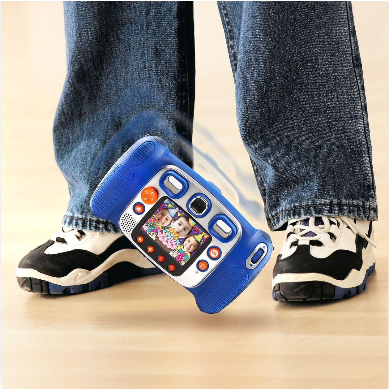
Image: The VTech Kidizoom Duo Digital Camera resting on the floor, highlighting its robust and child-friendly design.