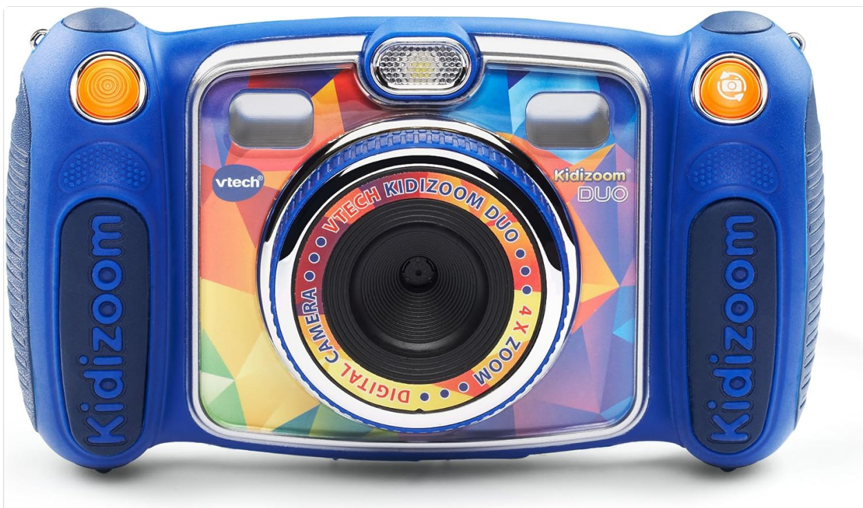
Image: Front view of the VTech Kidizoom Duo Digital Camera, showcasing its dual lens design and colorful faceplate.

The VTech Kidizoom Duo is a durable digital camera designed for children aged 3 to 9 years. It features dual lenses for taking photos and selfies, a color LCD screen, and various creative effects. This manual provides essential information for setting up, operating, maintaining, and troubleshooting your Kidizoom Duo camera.