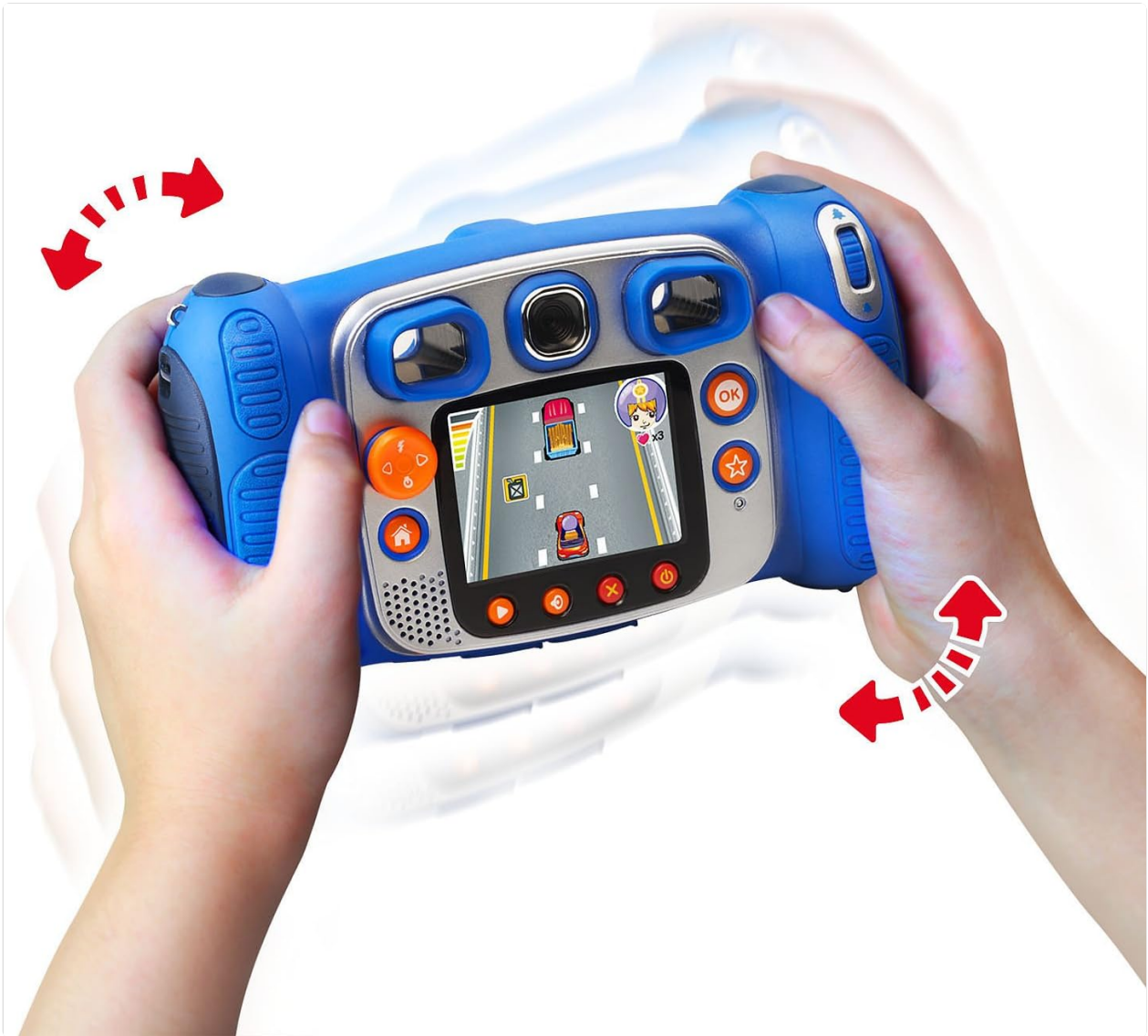
Image: A child engaging with a motion-controlled game displayed on the VTech Kidizoom Duo camera screen.

The camera includes five interactive games, three of which are motion-controlled, offering additional entertainment.