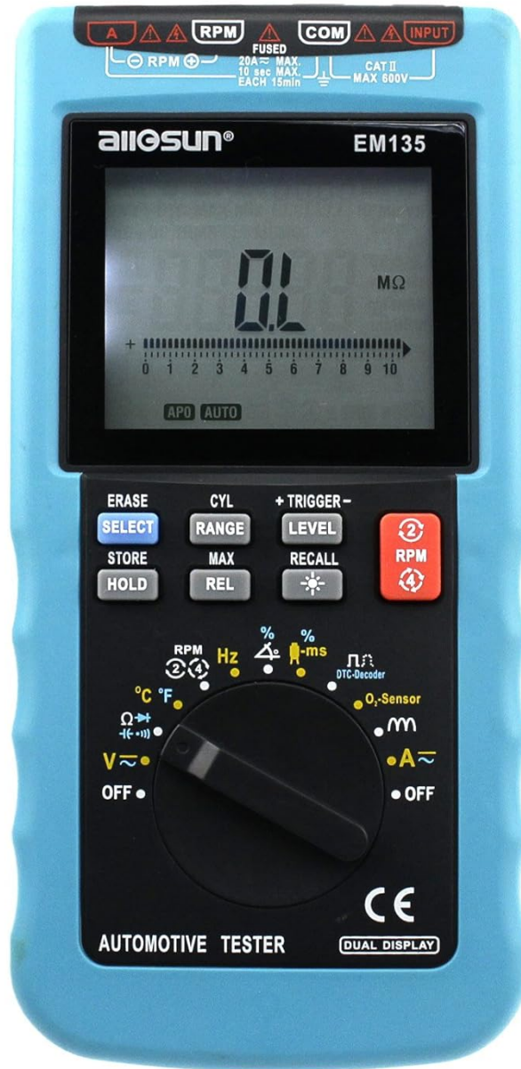
Figure 1: Front view of the ALLOSUN EM135 Automotive Digital Multimeter, showcasing its large LCD display and function dial.