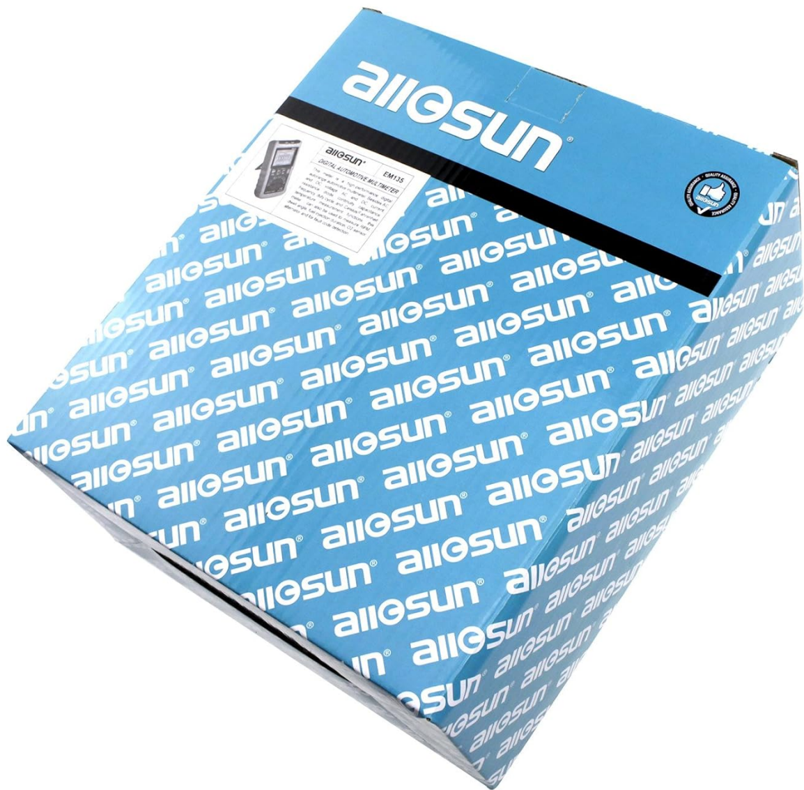
Figure 2: The ALLOSUN EM135 product packaging, indicating the contents within.