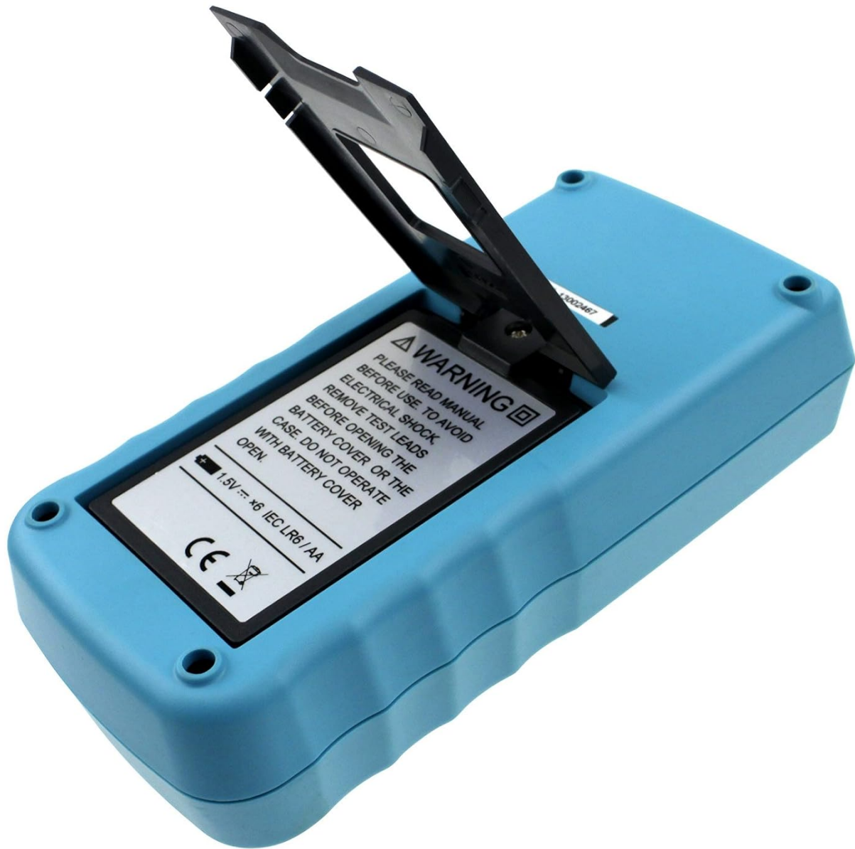
Figure 3: Rear view of the multimeter with the battery compartment open, showing where to insert the AA batteries.