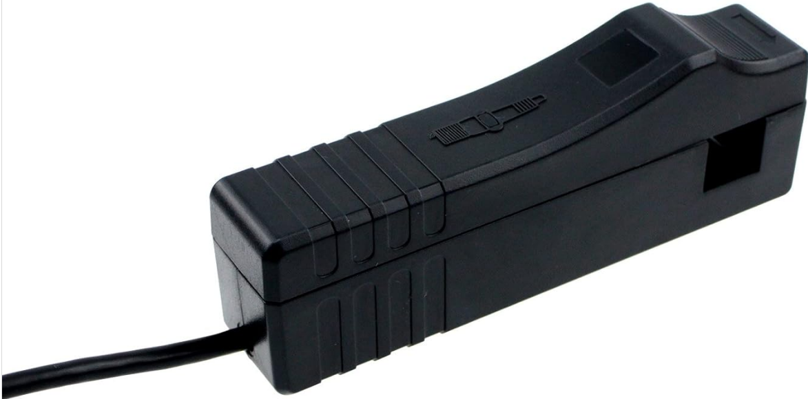
Figure 5: The RPM clamp lead, used for inductive RPM measurements on spark plug wires.

Video 7: Demonstration of measuring engine RPM using the ALLOSUN EM135 multimeter with the inductive pick-up.