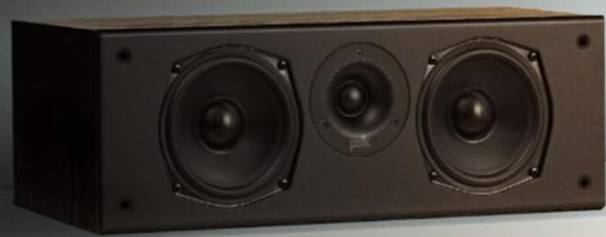
Image: The T30 speaker on a media console, illustrating its role in delivering crystal-clear dialogue for an enhanced viewing experience.

The T30 center channel delivers crystal-clear dialogue for everything you watch.