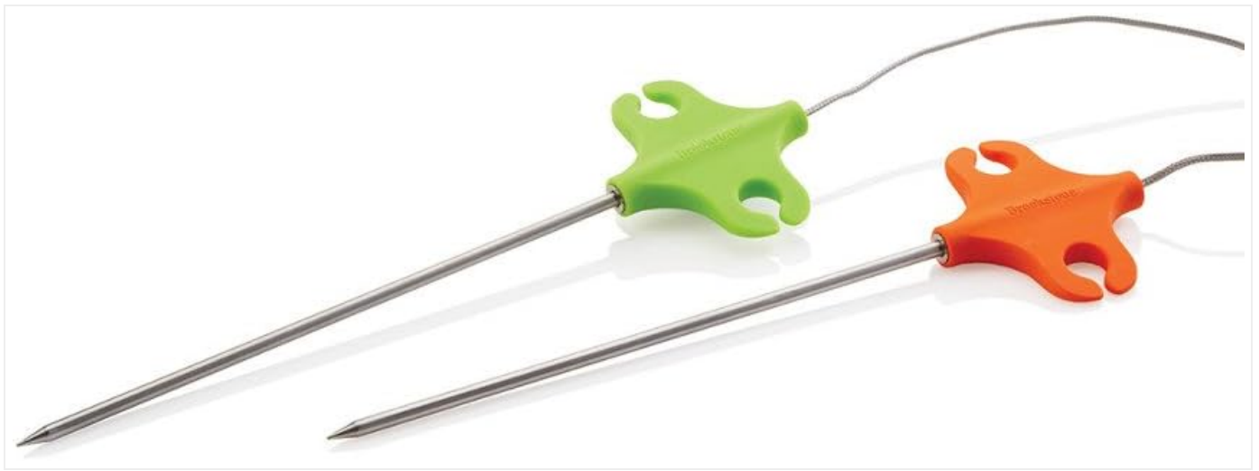
Image: A close-up view of the two temperature probes, one with a green handle and the other with an orange handle, designed for measuring internal food temperatures.