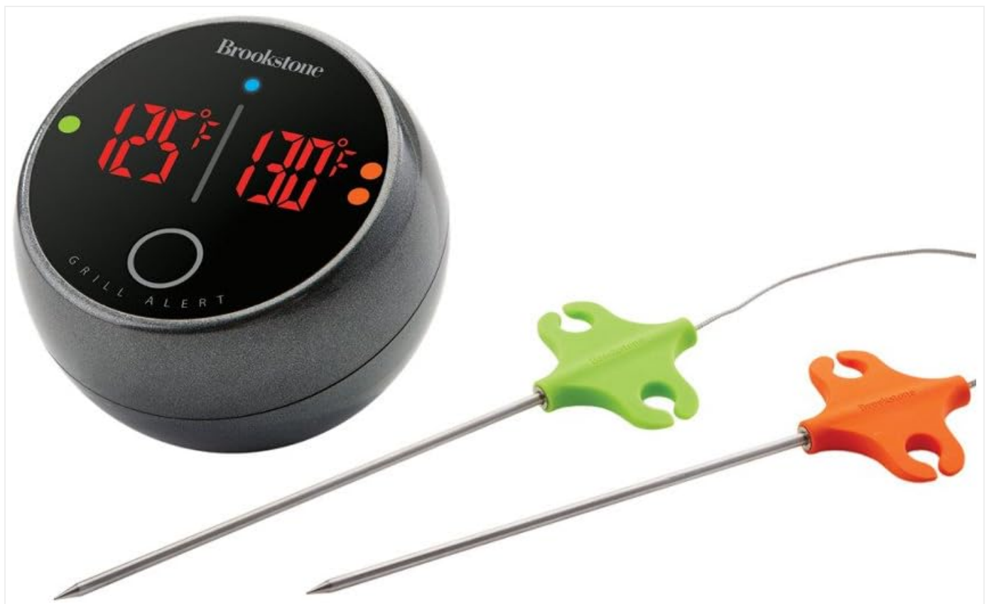
Image: The Brookstone Grill Alert thermometer unit displaying temperatures, accompanied by two color-coded temperature probes (green and orange).

The Brookstone Grill Alert Bluetooth Connected Thermometer is designed to help you achieve perfectly cooked meals by monitoring internal food temperatures and alerting you via a connected smart device. This device features dual probes, allowing you to track two different food items simultaneously.