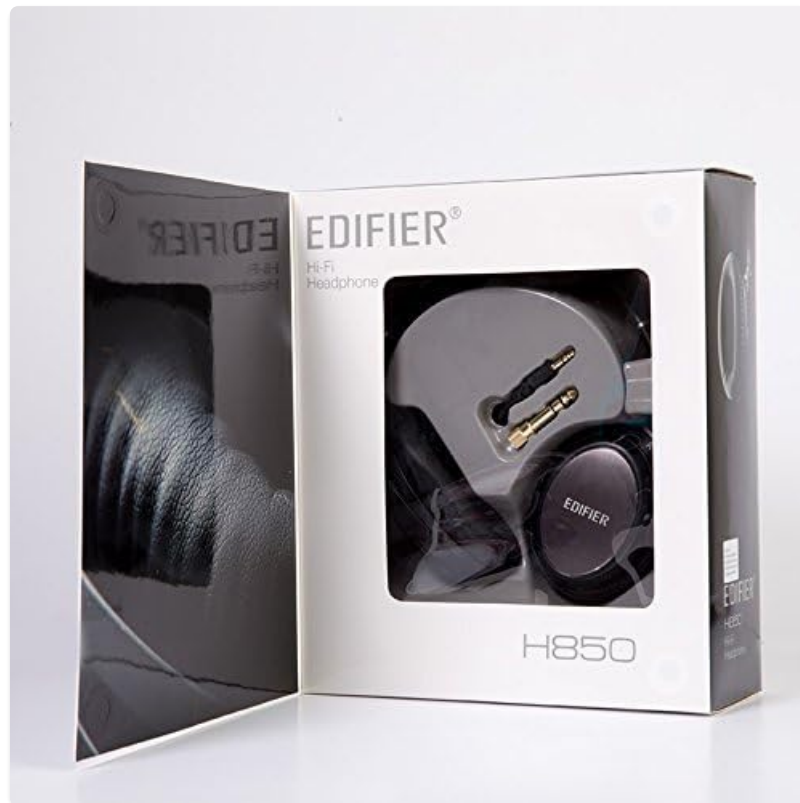
Image: The Edifier H850 headphones are shown in their original retail packaging, illustrating how they can be stored securely when not in use.