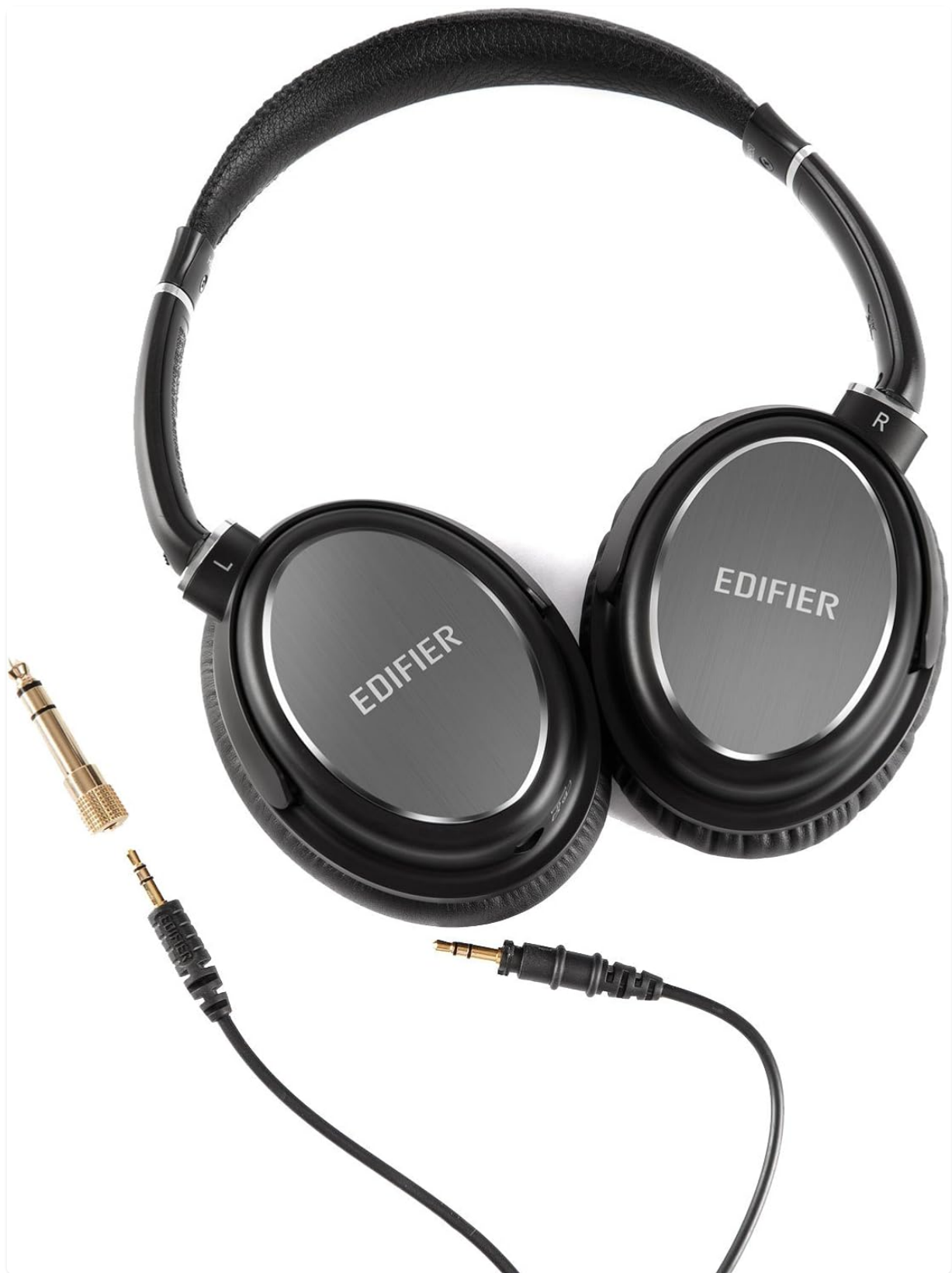
Image: Edifier H850 headphones shown with their detachable audio cable and the included 1/4-inch adapter.