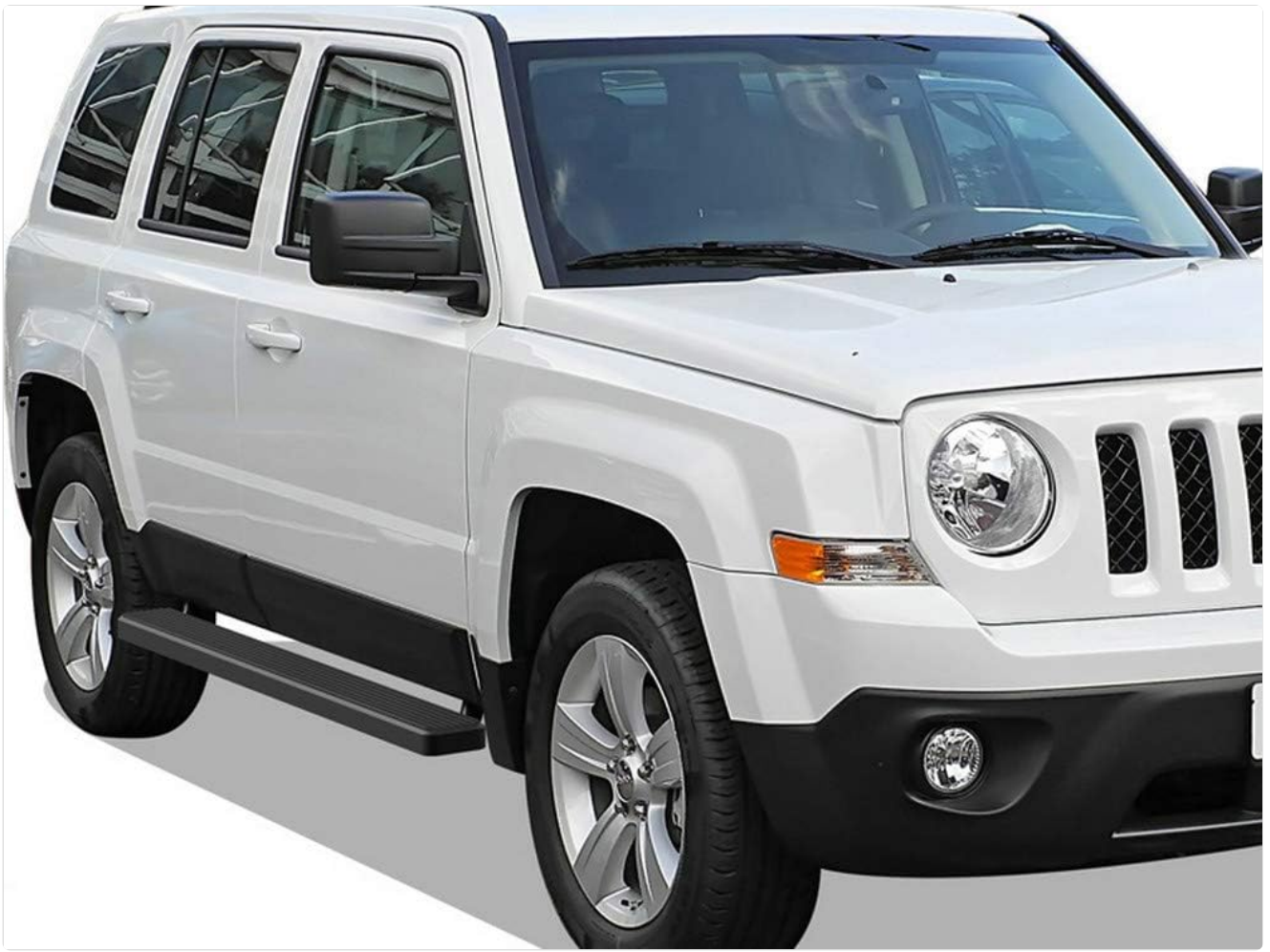
Image: APS 5-inch Black Aluminum Running Boards installed on a white Jeep Patriot. The running boards provide a sleek, integrated step along the side of the vehicle.