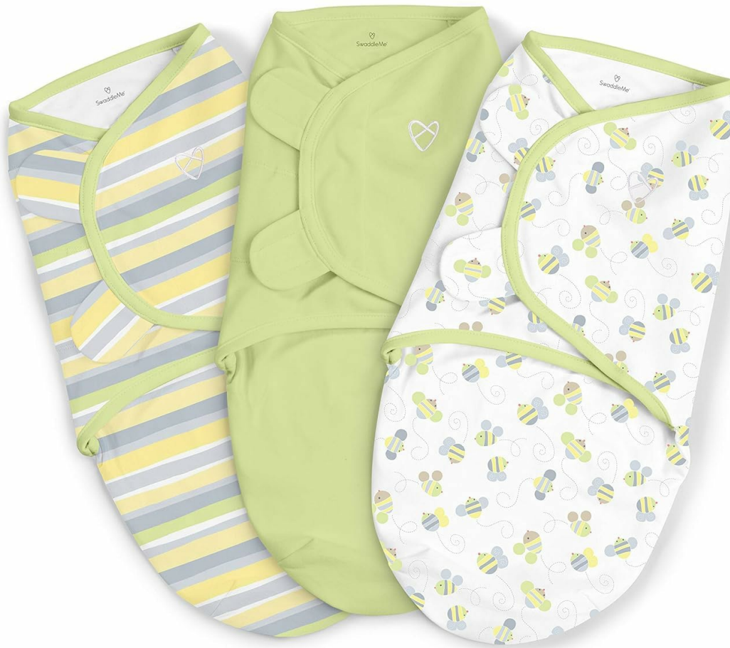
Image: Three SwaddleMe Original Swaddles in various designs, including yellow stripes, solid green, and a white swaddle with a busy bees pattern. These are the 3-pack included with the product.