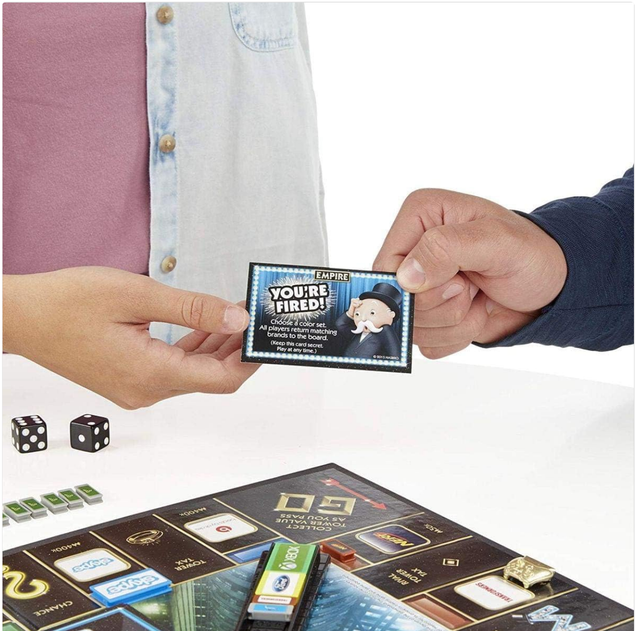
Image: Two players' hands interacting with the Monopoly Empire game board, showing an 'Empire' card being played and dice on the board. This demonstrates a typical moment during gameplay.

The first player to successfully fill their tower with billboards wins the game. This signifies complete dominance of the brand empire.