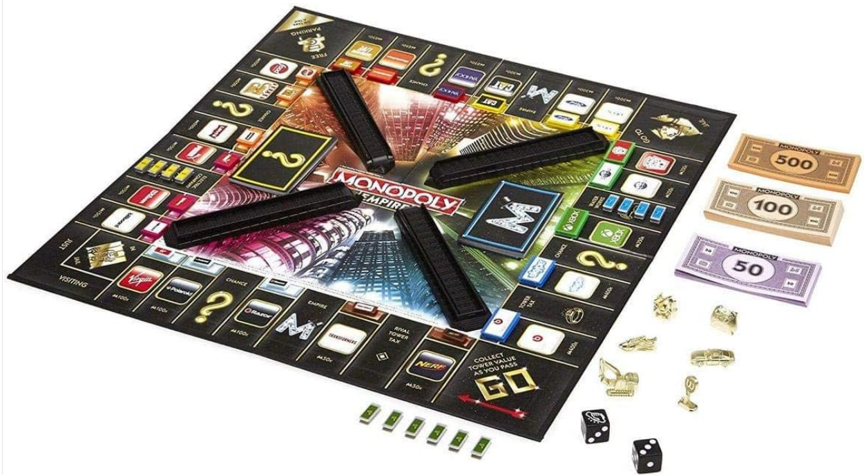
Image: A close-up view of the Monopoly Empire game board with money, dice, and player tokens positioned. This illustrates the initial setup of the game.