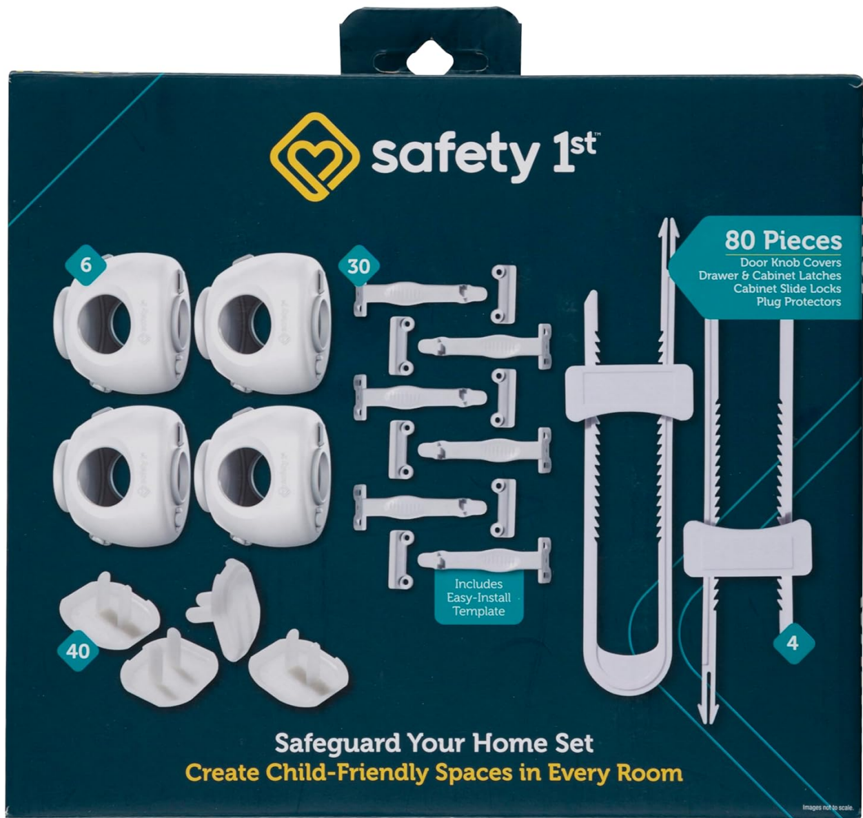
Image: Overview of the 80-piece Safety 1st Home Safeguarding Set.